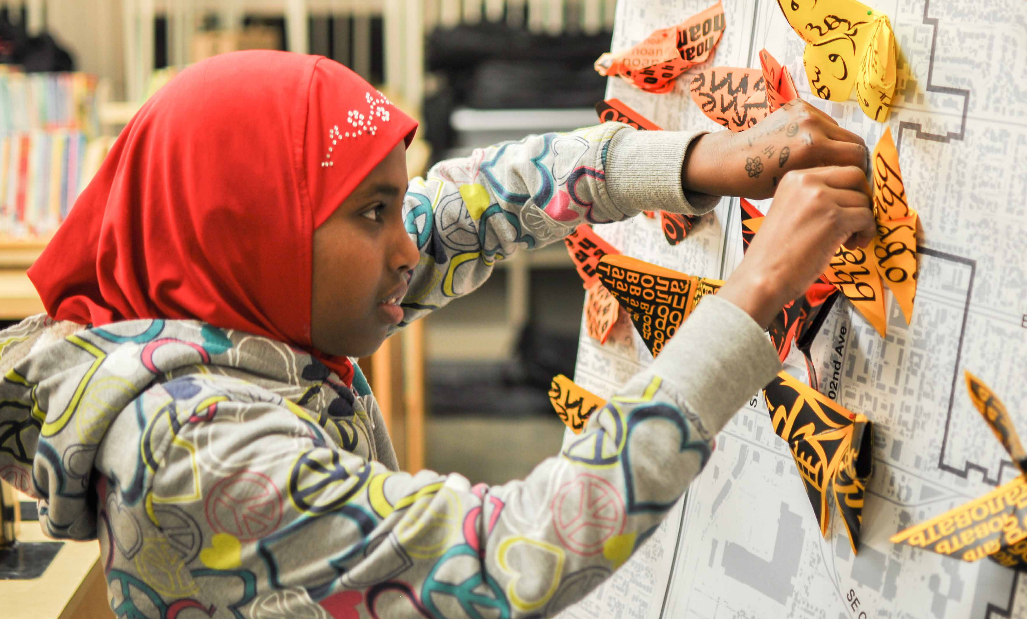
Inclusion. Passed down from previous generations, the power of hope for a community where 70 languages are spoken, remains. The Monarch, ' Danaus Plexippus ' (Sleepy Transformation) sparks this journey through a series of community engagement gatherings and celebrations.