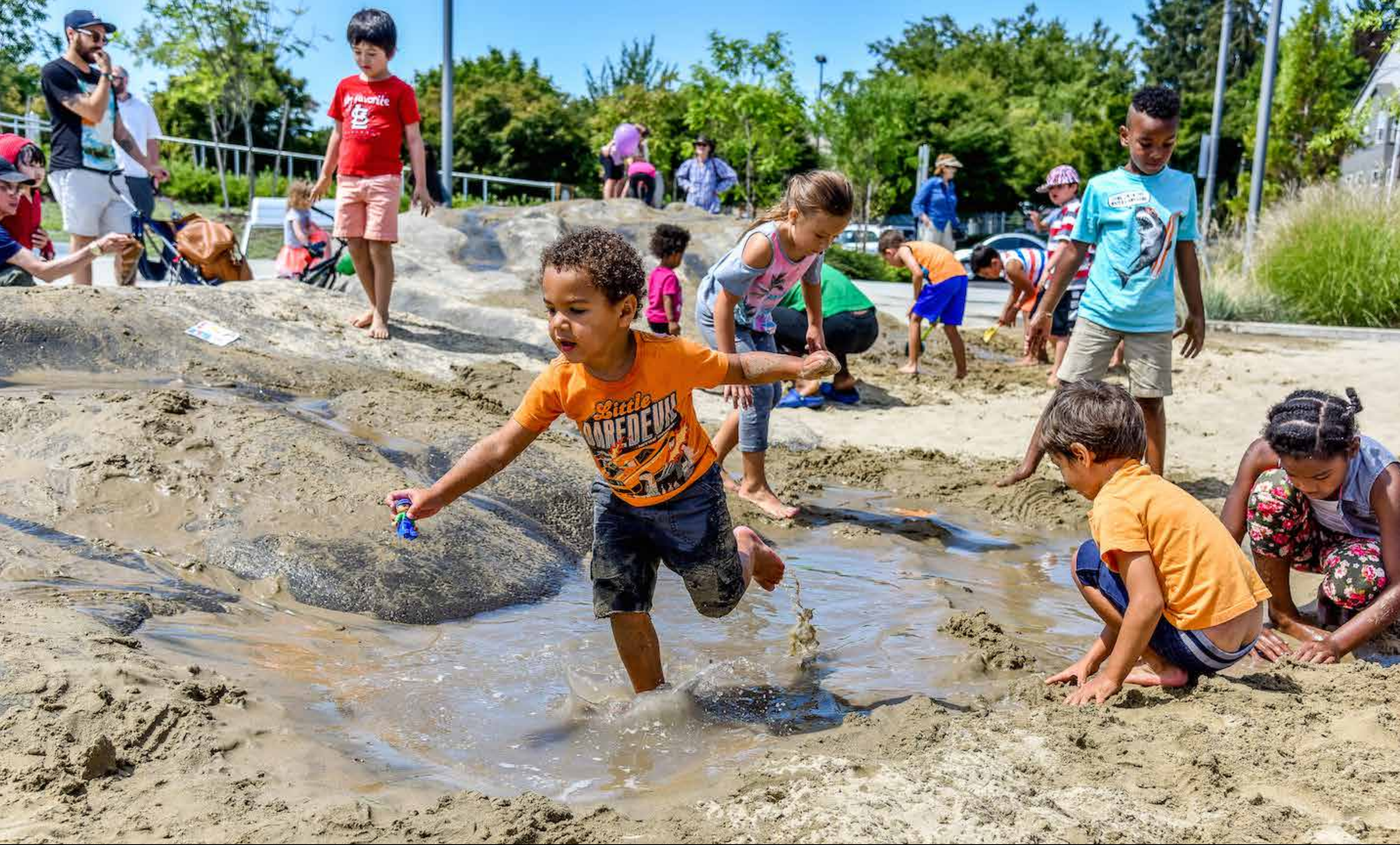
Sensory Rich Experience. Sand and water are critical organic elements found in the playground. A hand-operated wheel pumps water onto an elevated sand table (custom designed to accommodate wheelchairs) where the two materials mix with natural cooperation.