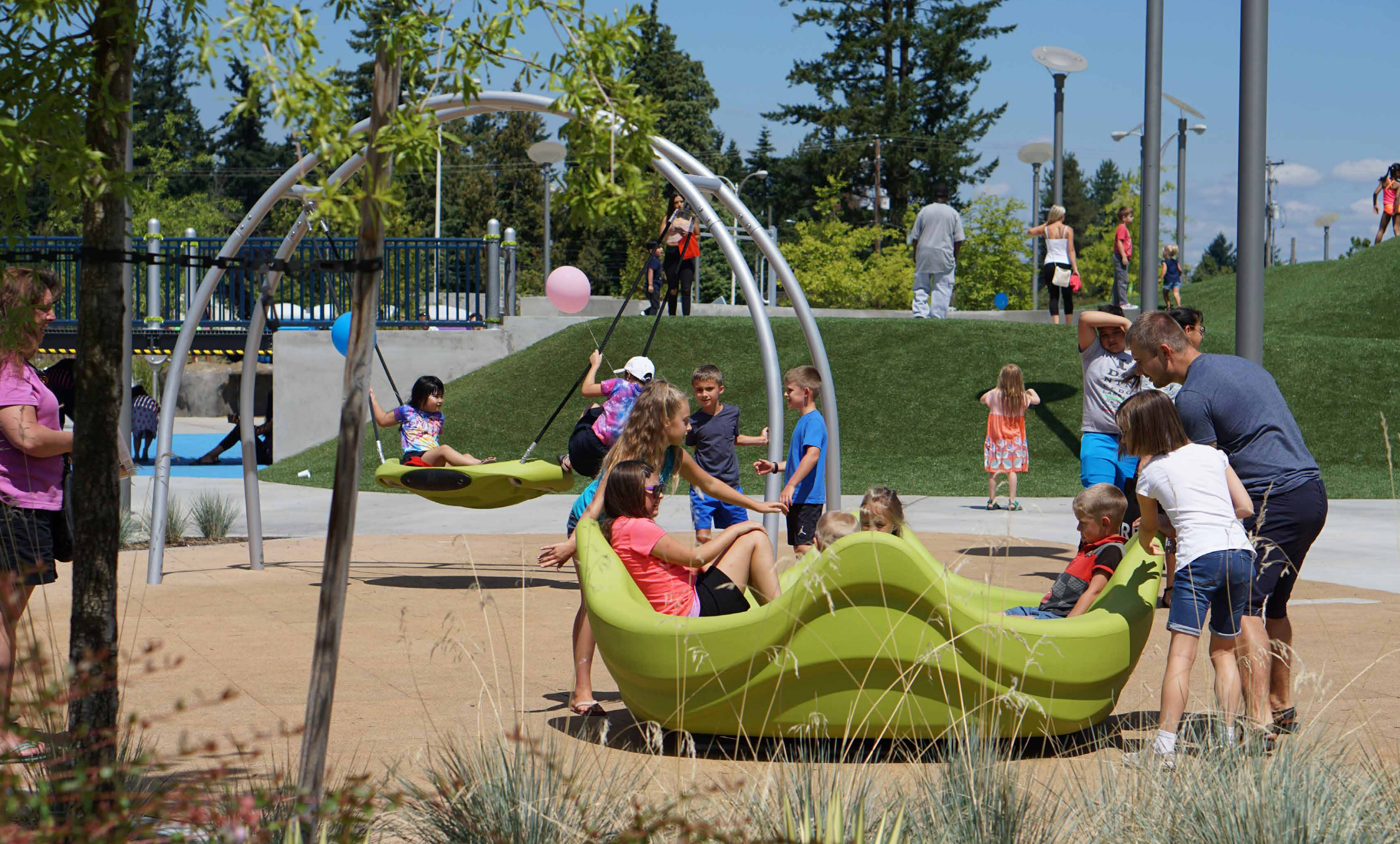
Memories. Sustainable playground surface materials are designed to fit in the landscape and feel cohesively integrated into nature with paths winding up and down over differing heights of topography accessible by all.