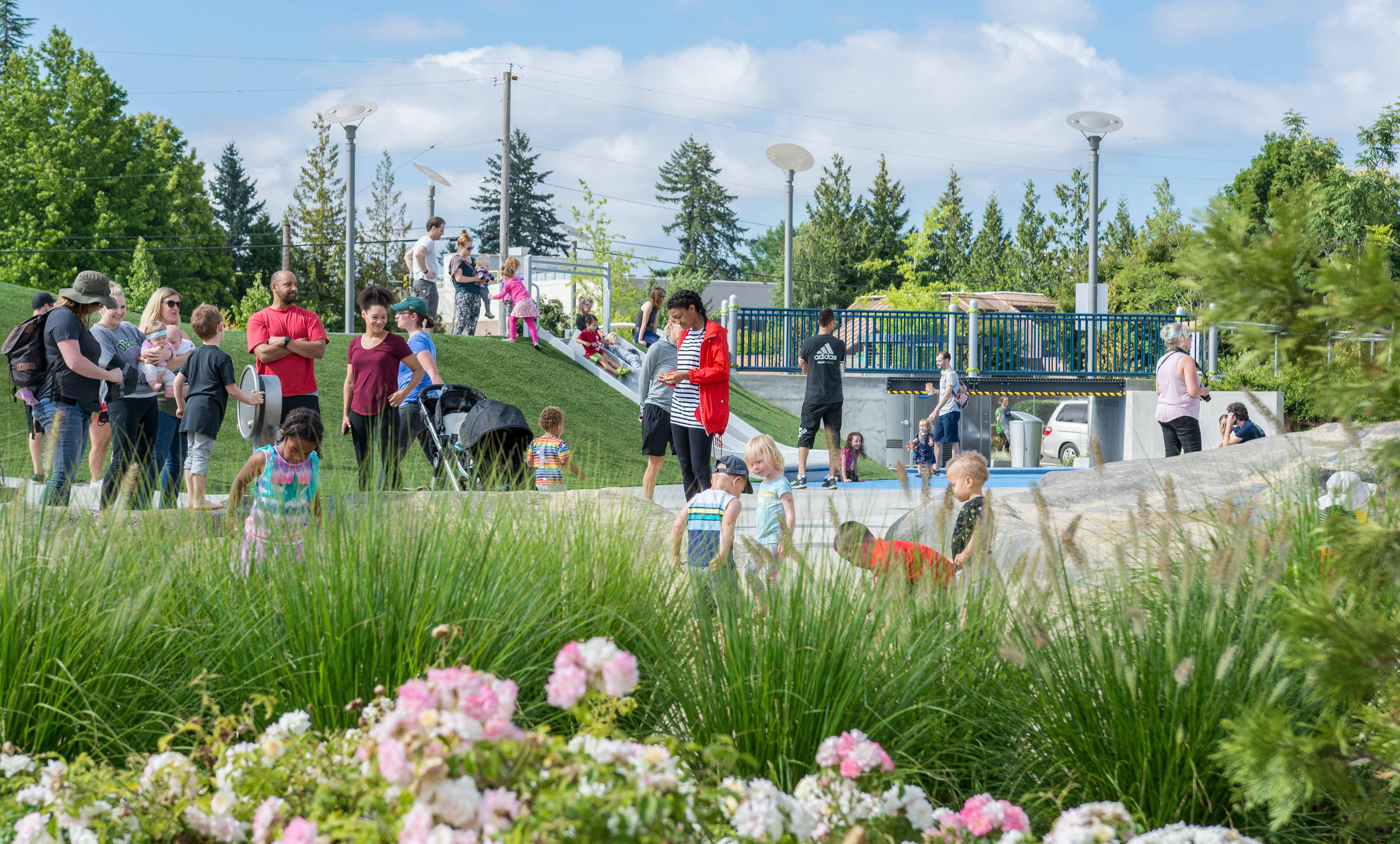
Sustainability. From brownfield to thriving park, use of nature-based stormwater and landscaping of shade inducing trees, street trees, and native vegetation reclaimed the degraded site promoting green infrastructure that recreates lost hydrologic function and enhances Gateway's EcoDistrict placemaking goals.