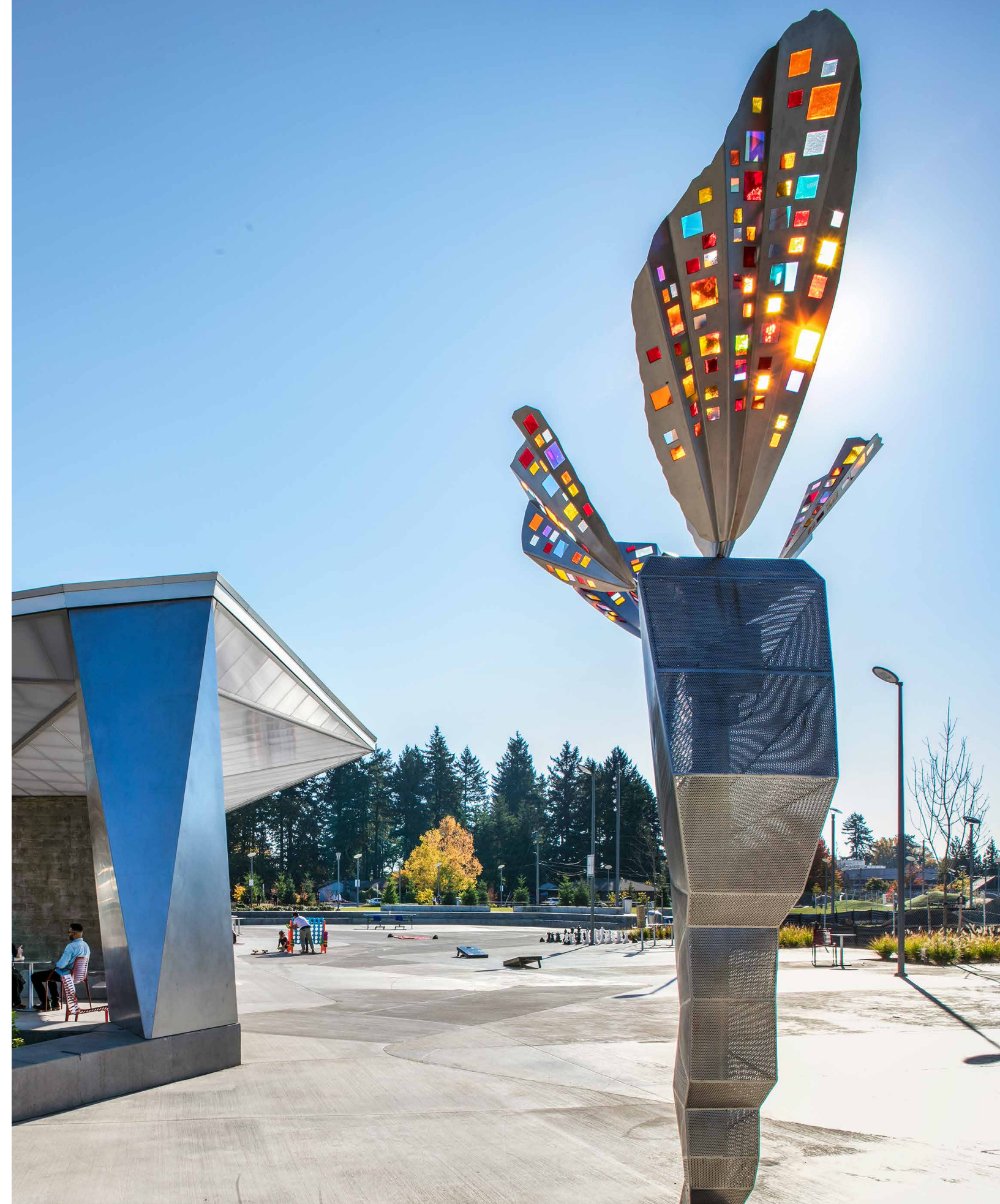
Transformation. The majestic butterfly wings, the Fifth Wind , represent symbolically a gratitude and appreciation for the selfless contributions of the Gateway community members narrating their journeys, ancestral and contemporary.