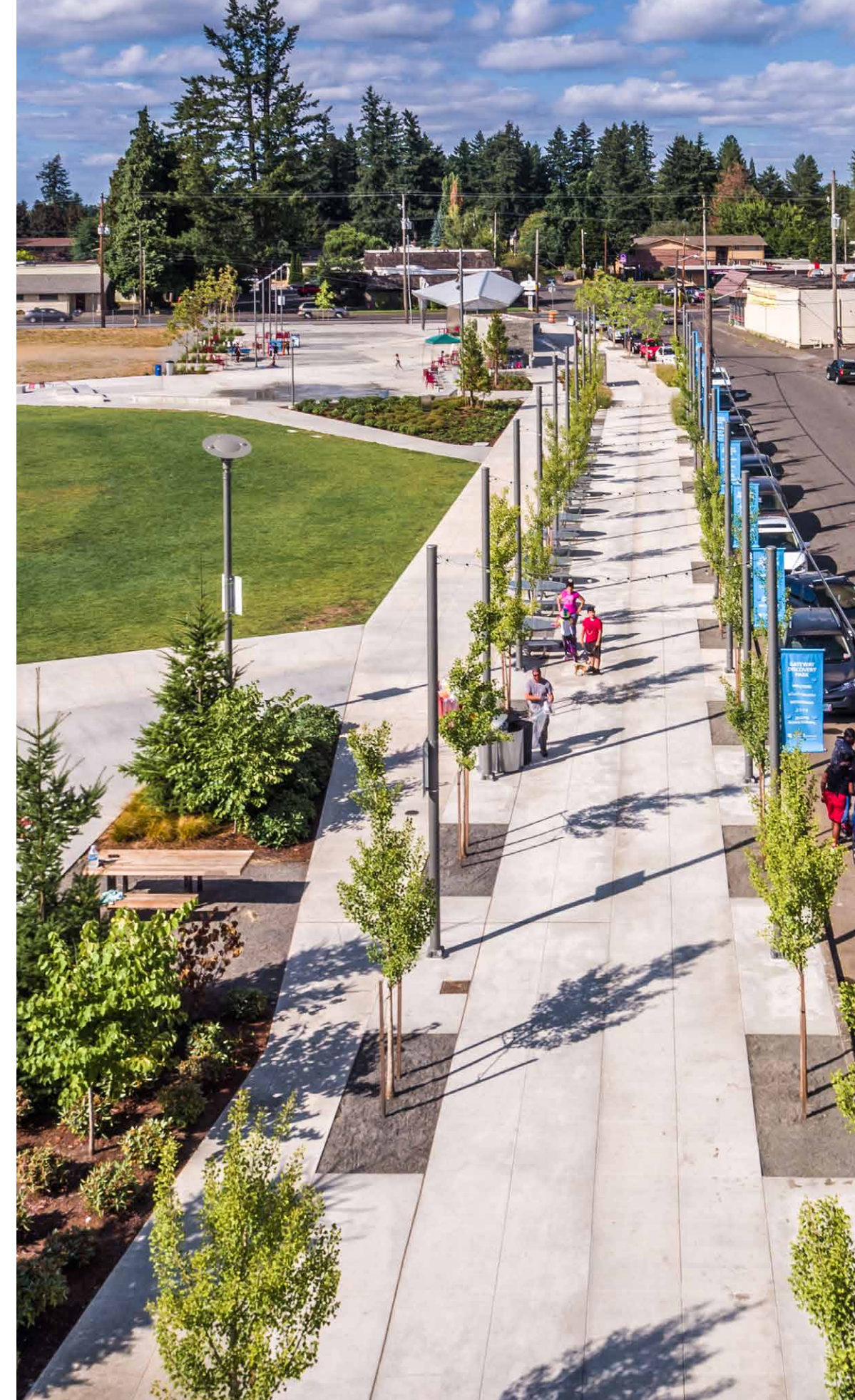
Lasting Connections. The flexible paseo design accommodates seasonal activities, a place for dining, markets, conversations, and festivities magnetically leading pedestrians into the park.