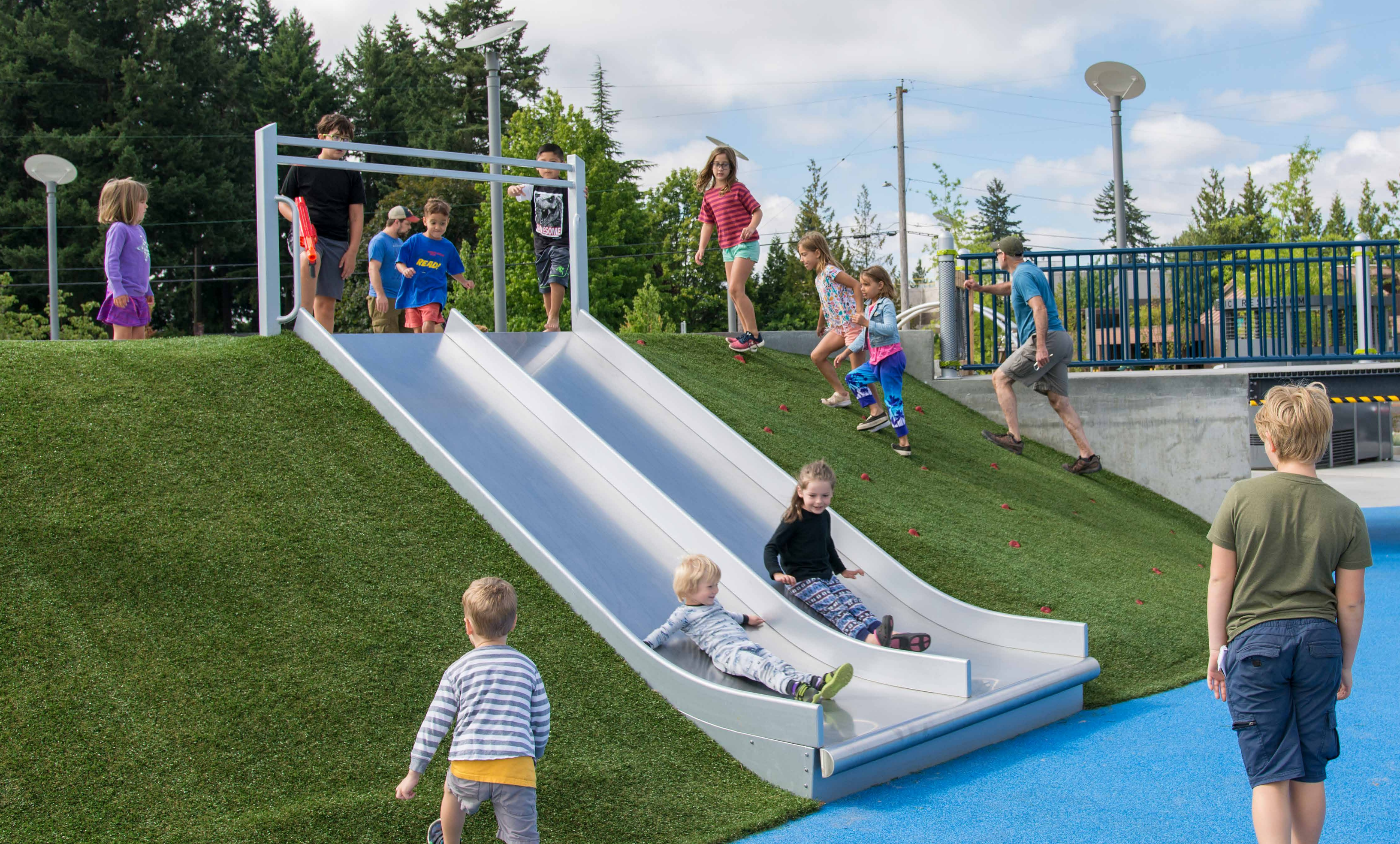
Playful Learnings. With pathways and ramps, once at the top an innovative custom two-wide chute slide, pioneered by the landscape architects, allows 'friends' to slide down together. Today, you'll find this slide at every inclusive designed park throughout Portland.