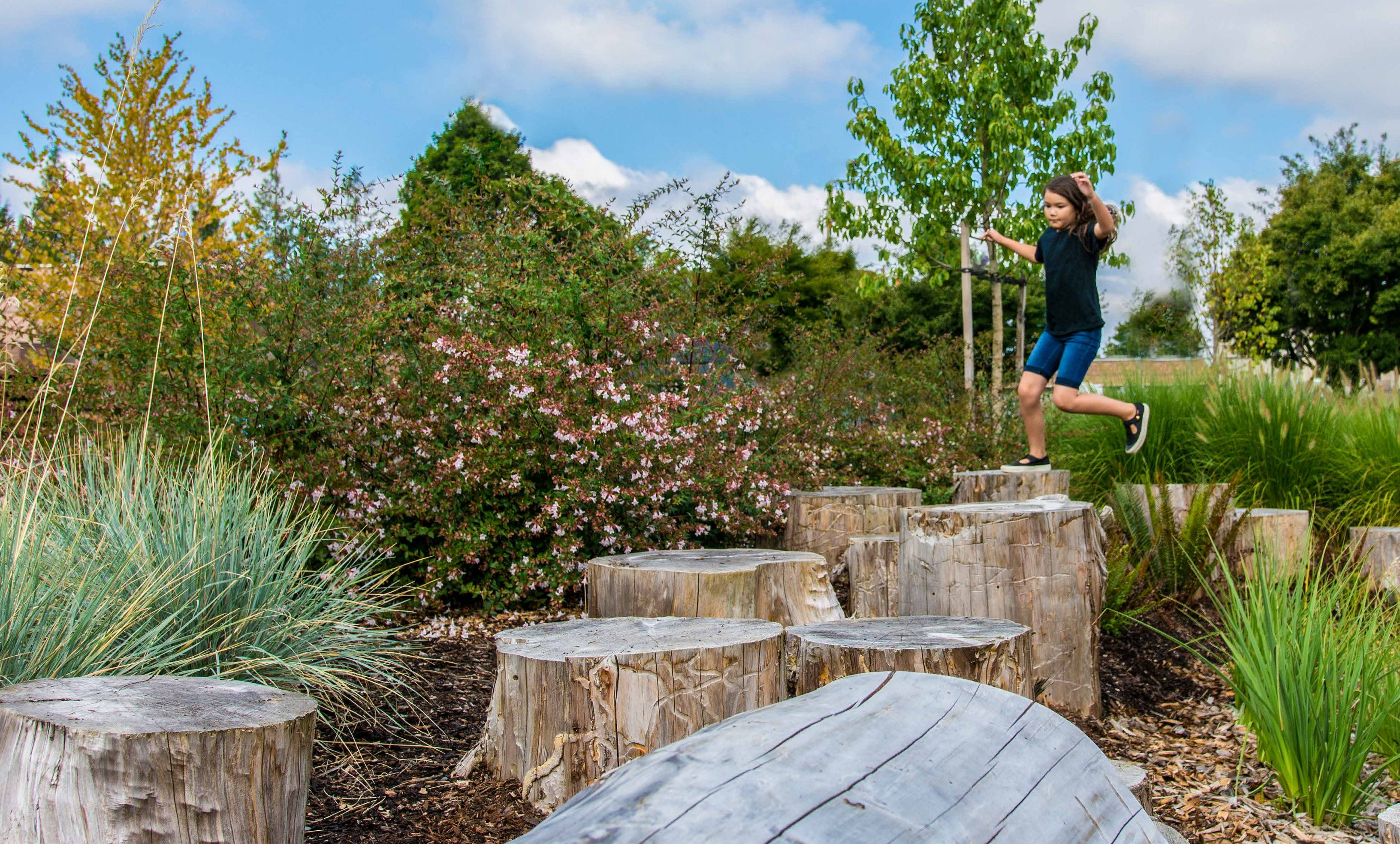
Biophilia. Engaging with the environment through tactile manipulation, direct observation, and first-hand experience the natural play area was designed to evoke both the serenity and liveliness of being in the woods for all who lack direct access with nature.