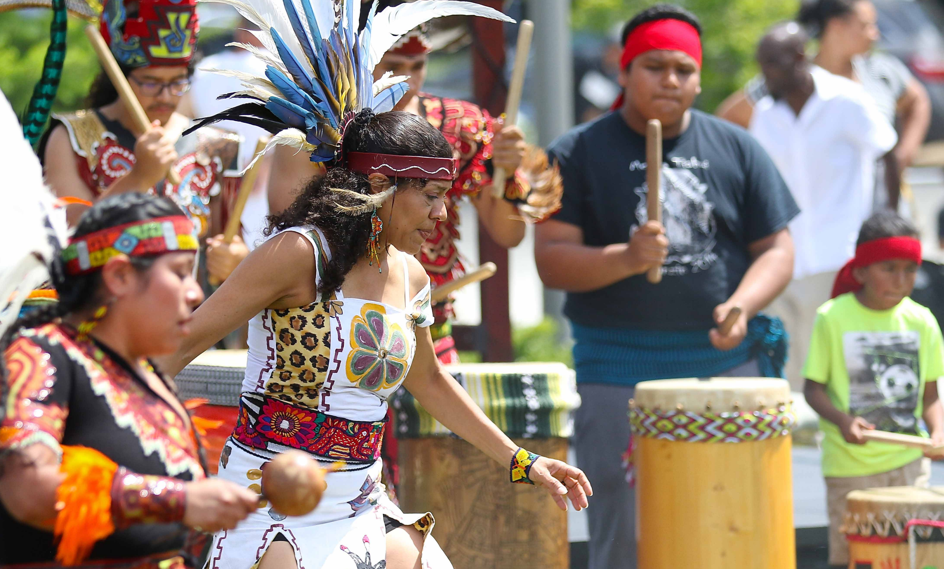
Reverence. Long before a shopping center thrived and perished, and more recent immigrants enlivened the Gateway community; Cowlitz, Cascades, and Confederated Tribes of Grand Ronde have been stewards of this land.