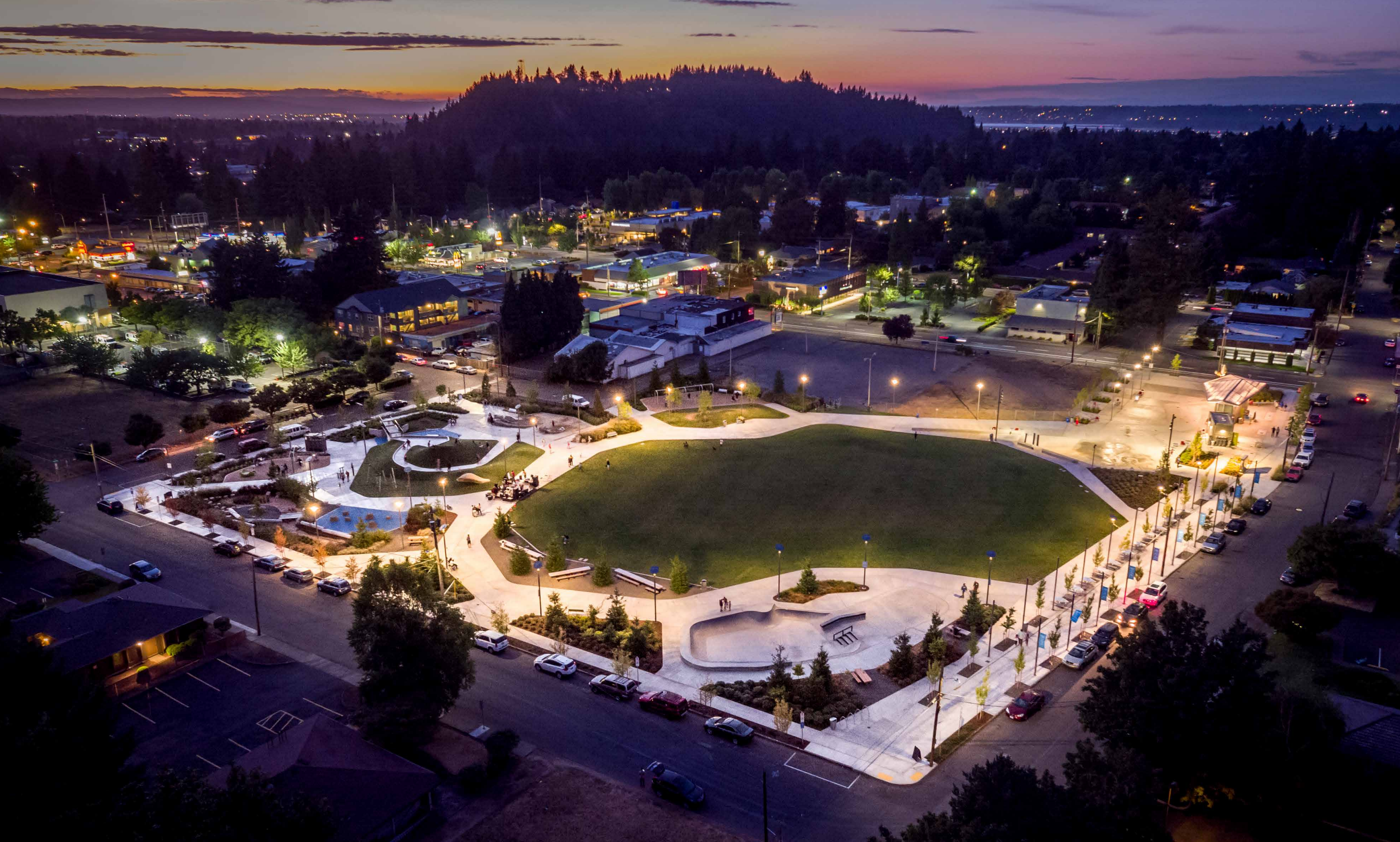
Stewardship. Preparing the community to lead change and improve the world is an act of informed optimism inspired by a civic open space embracing skatepark, splash pad, sand/water discovery, performance space, picnic grove, active paseo and nature play.