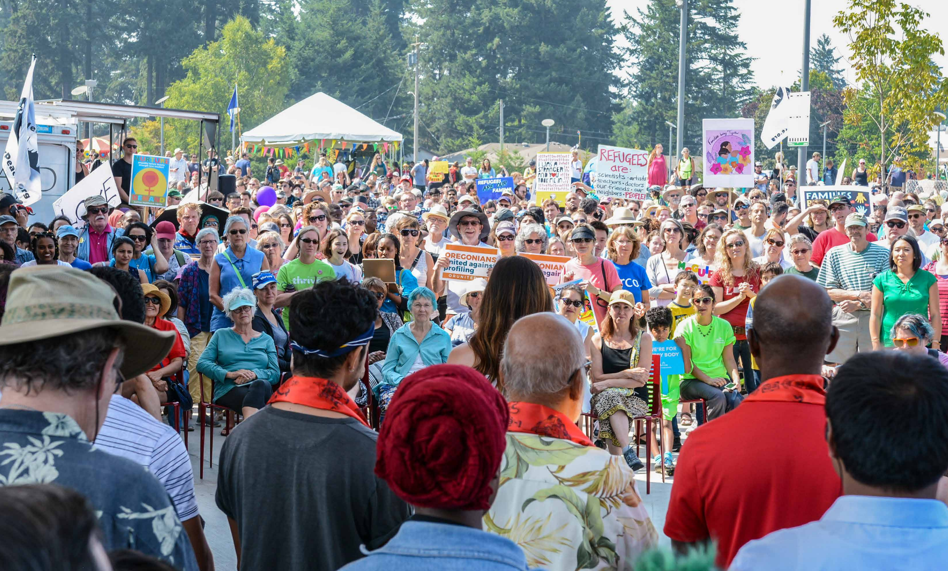
Social Equity. Bringing Portland closer to addressing historic inequalities, Gateway Discovery Park provides access within a half-mile walk to over 800 households. One-third of these households are racial or ethnic minorities, and a quarter are living in poverty.