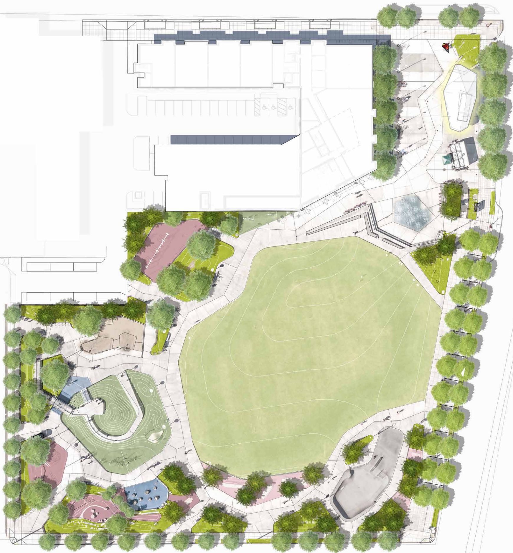
Urban Wonderland. Completed prior to COVID-19, at the edge of Portland's displacement zone, near a confluence of freeways and light-rail transit stops, this urban wonderland provides a daily oasis of hope as a counter to mental fatigue during the pandemic.