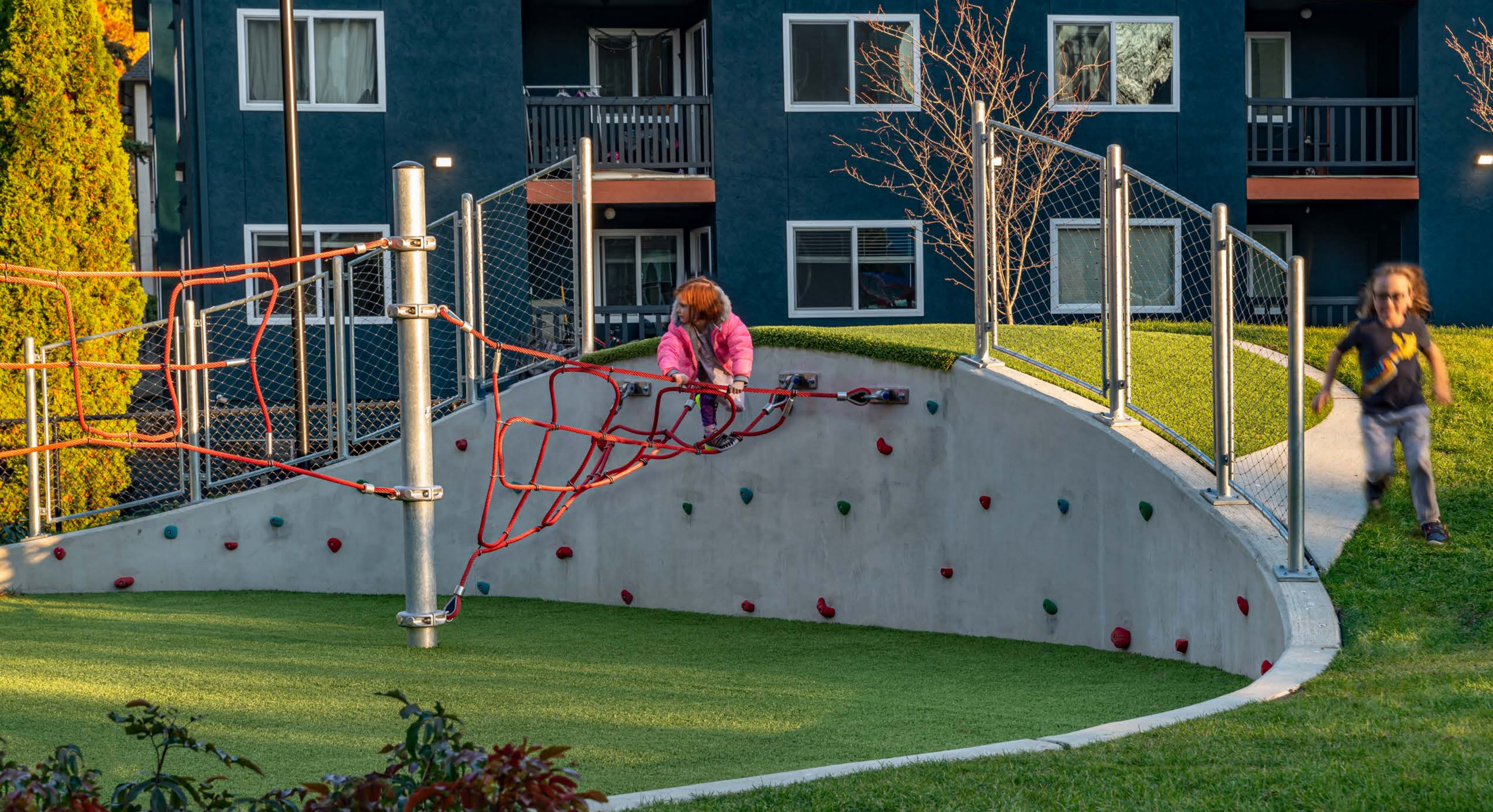
An undulating lawn and climbing wall form some of the distinct play programs wished for by the community. Physical, sensory, and nature play experiences that invite challenge and discovery are encouraged throughout the park.