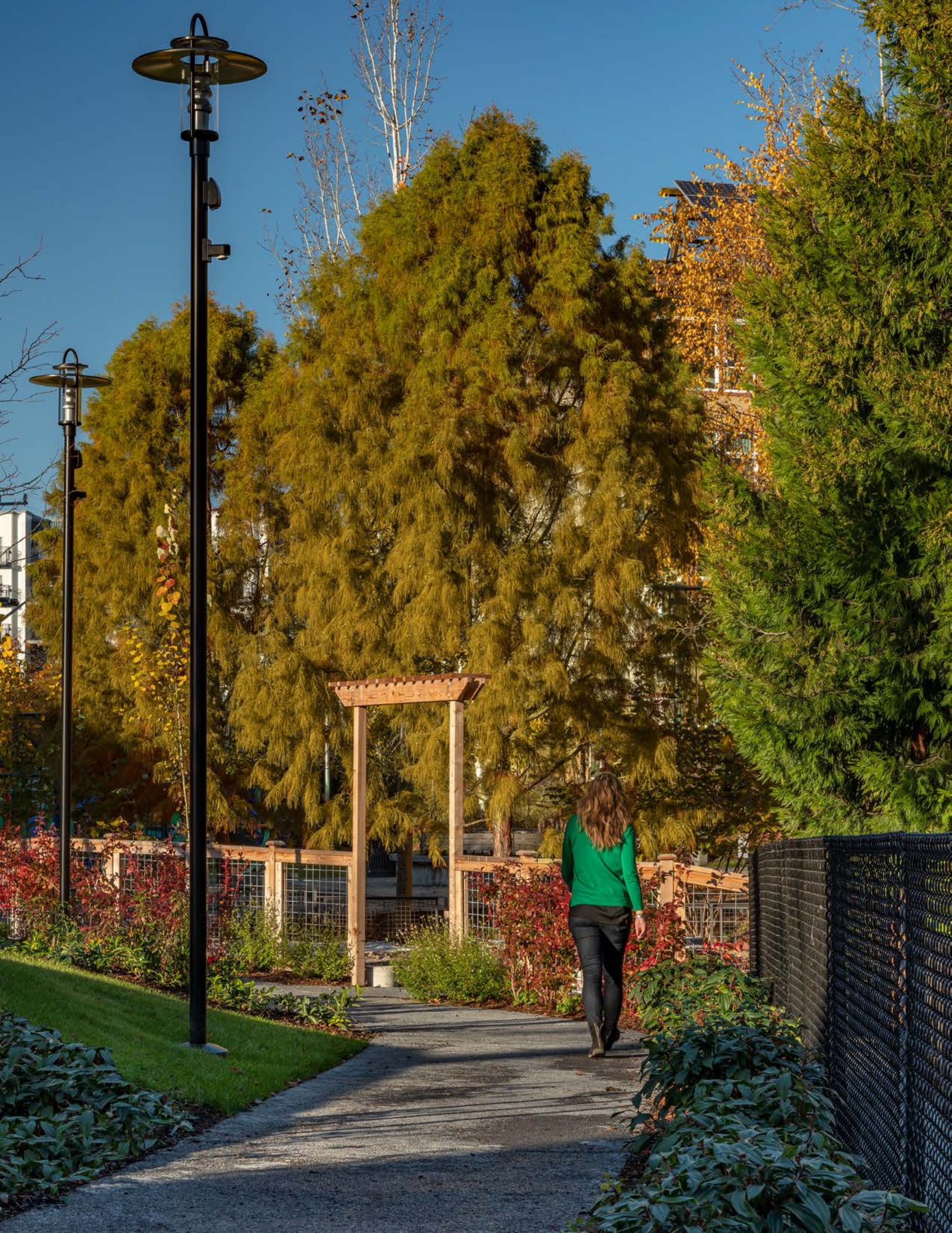
Along Lake City Park's perimeter, the walking path continues, bordered by established trees and edible plants for gleaning.