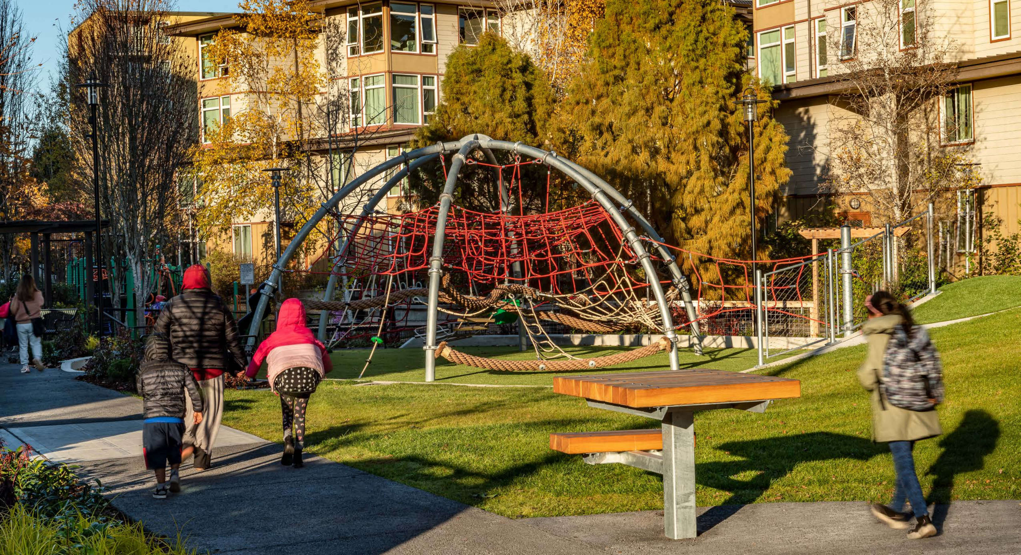
With careful design planning, Lake City Park accommodates a diverse mix of community-requested programs, allowing the postage stamp site to serve as a neighborhood hub and community gathering space.