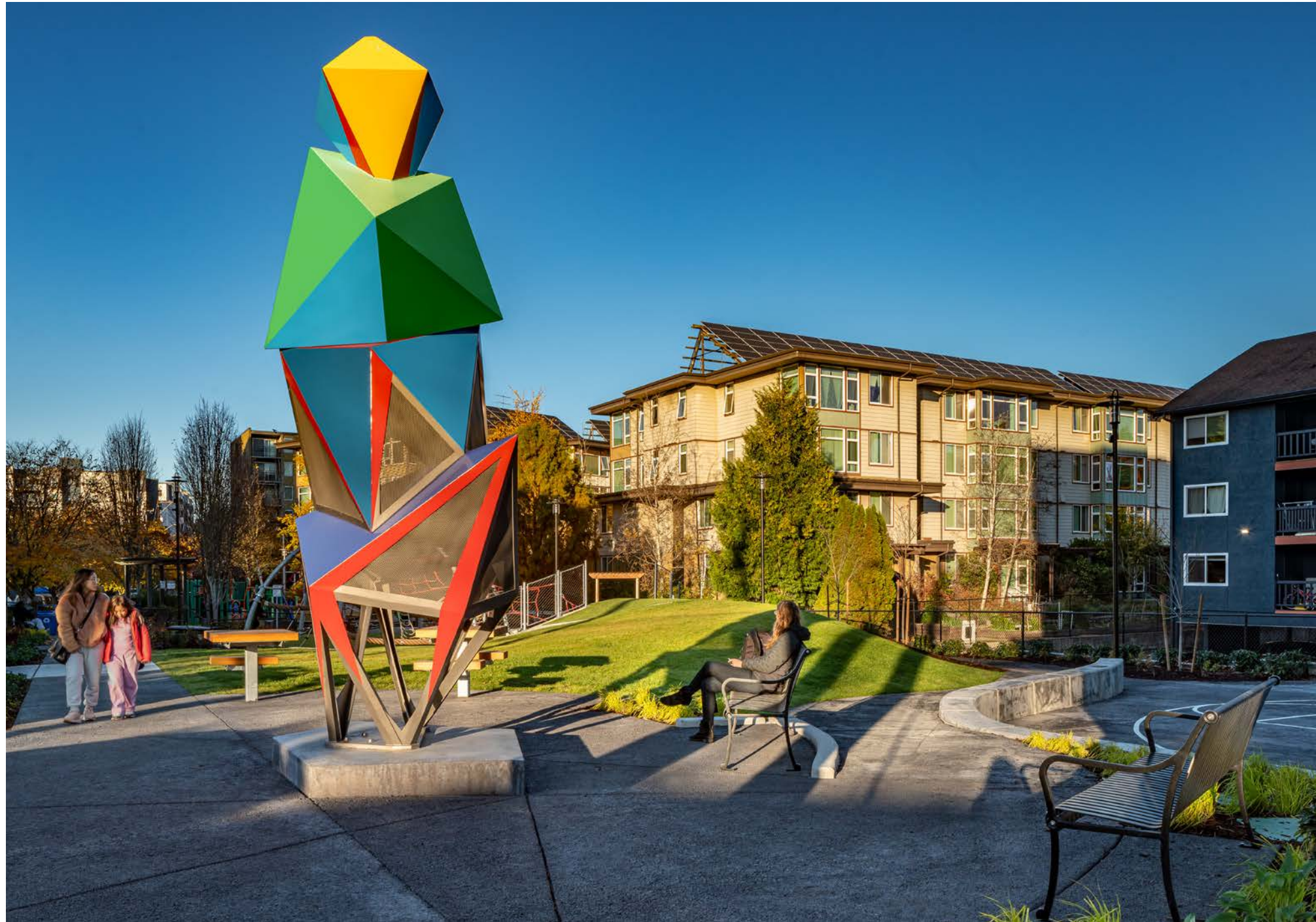
Rock Stack , a vibrant, cairn-inspired sculpture welcomes visitors with joyful colors and a bold, geometric shape. This unique art piece is inspired by, and representative of, the multifaceted Lake City community, celebrating the importance of unity and collaboration.