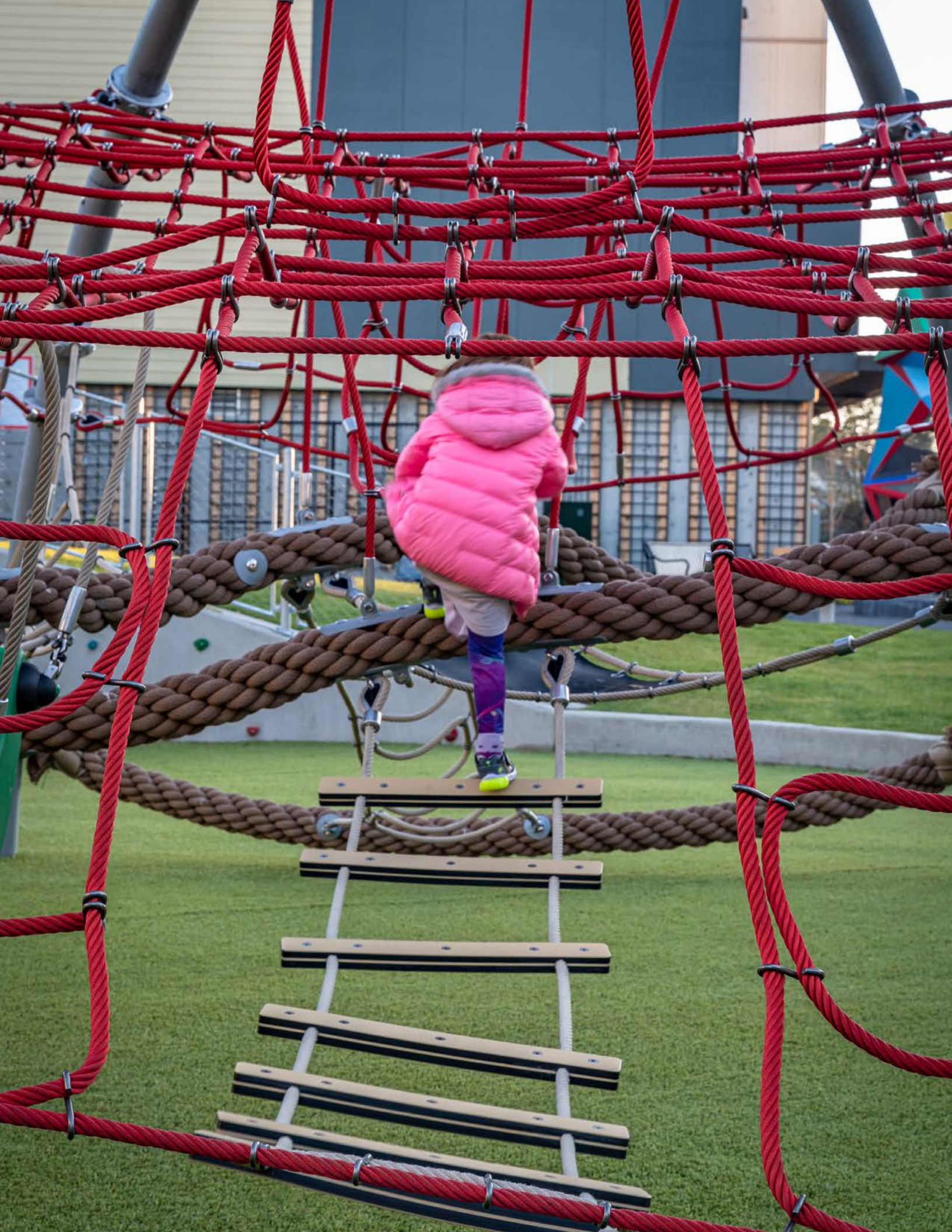
The large net climber offers lower ropes for youngsters and higher levels for challenge seekers. A custom addition allows children to start at one end of the net climber and connect to the climbing wall without touching the ground.