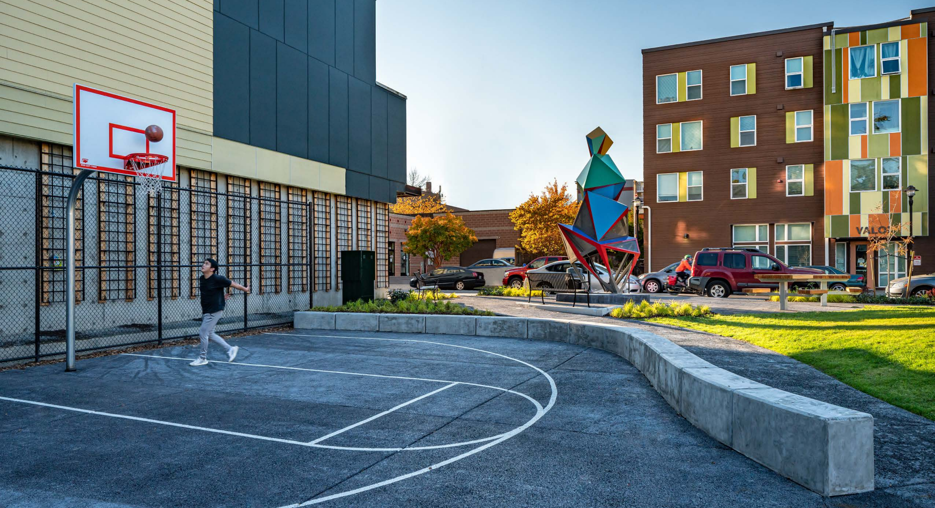
Just beyond the park's main plaza, a half basketball court with a seating wall for spectators highlights the balance of both active and passive pursuits within the park's boundaries.