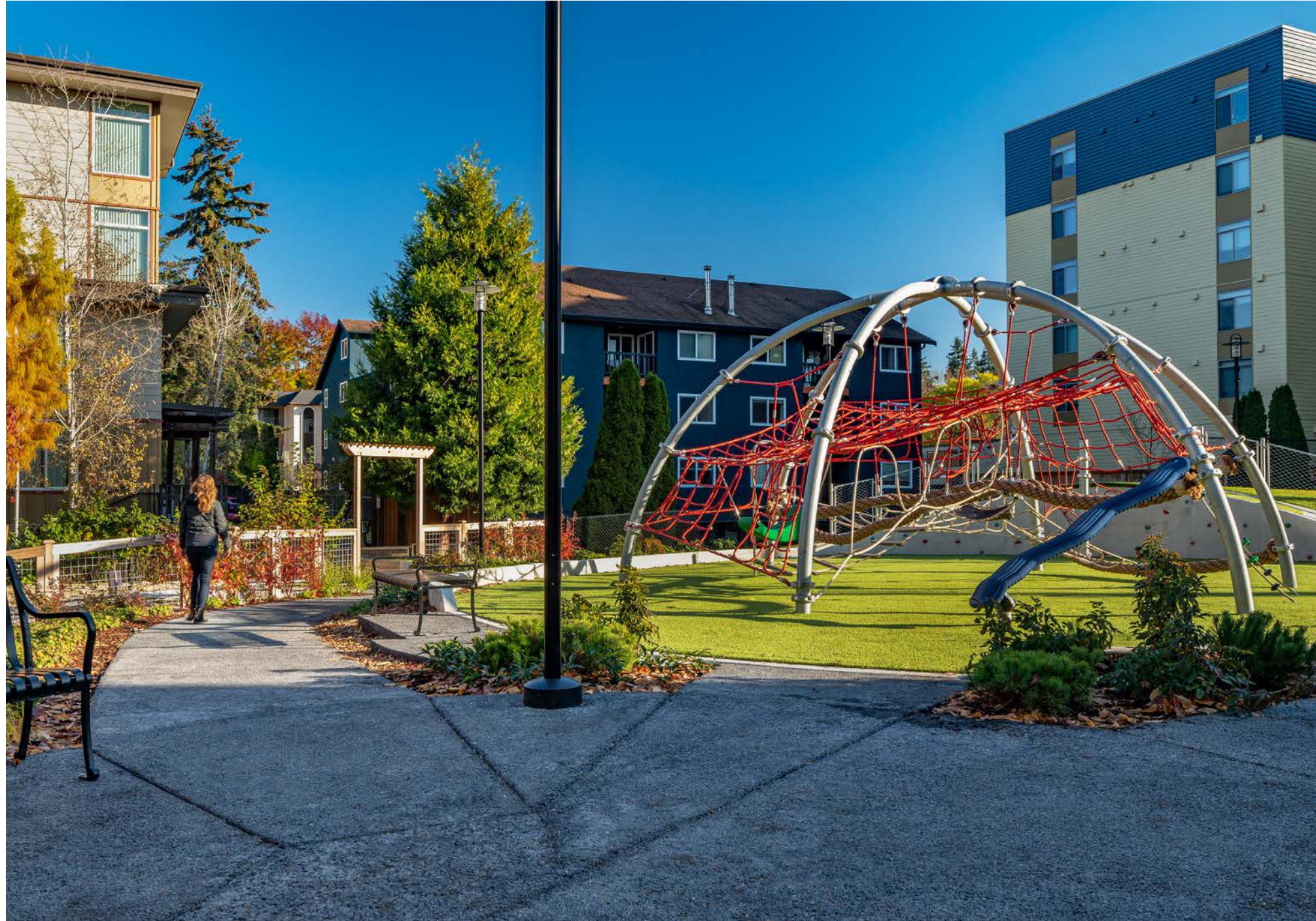
A plant-lined walking path paved in porous concrete leads from the small plaza and curves between a P-Patch and turf play area, while benches create opportunities to rest and observe.