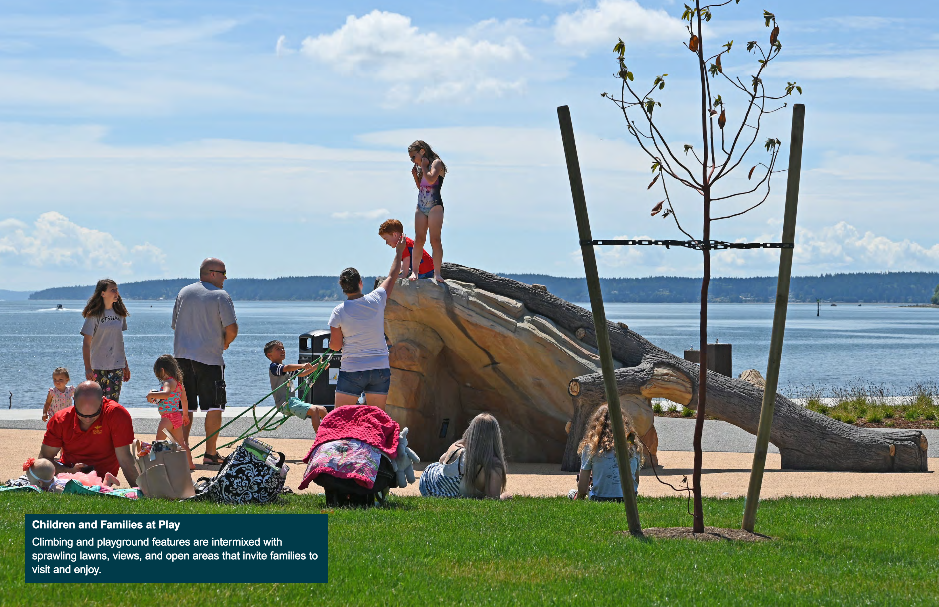
Children and Families at Play Climbing and playground features are intermixed with sprawling lawns, views, and open areas that invite families to visit and enjoy.