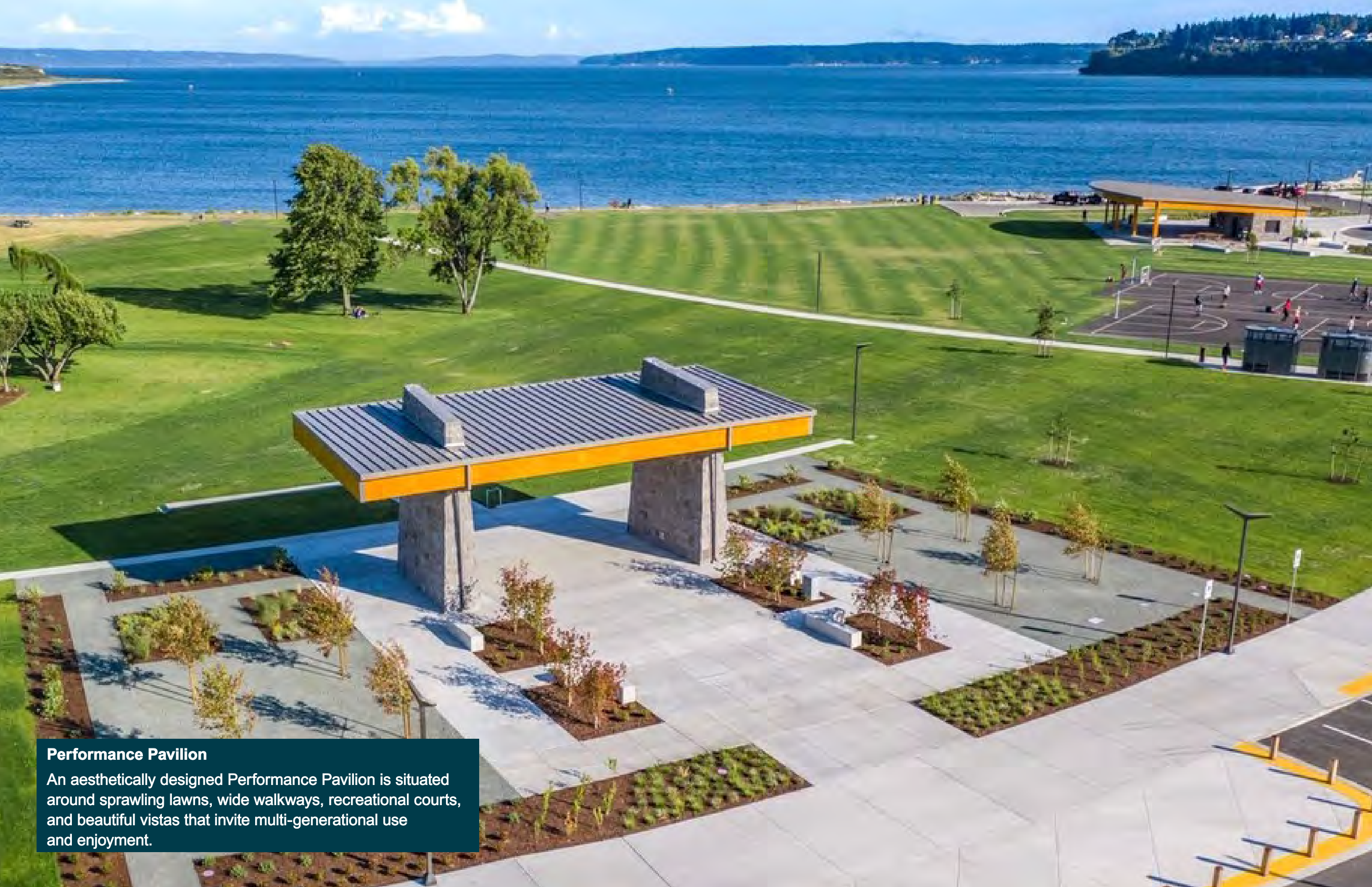
Performance Pavilion An aesthetically designed Performance Pavilion is situated around sprawling lawns, wide walkways, recreational courts, and beautiful vistas that invite multi-generational use and enjoyment.