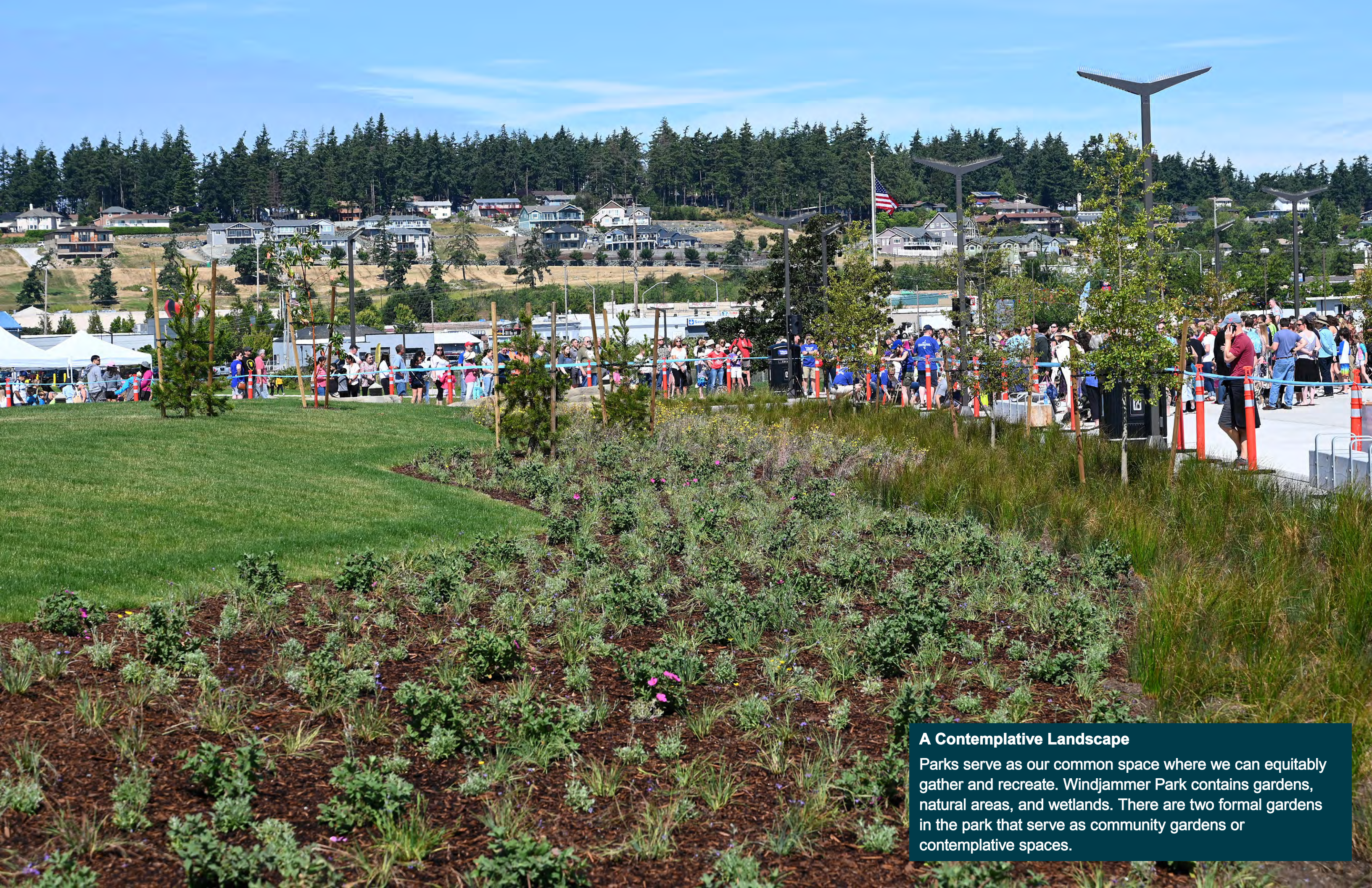
A Contemplative Landscape Parks serve as our common space where we can equitably gather and recreate. Windjammer Park contains gardens, natural areas, and wetlands. There are two formal gardens in the park that serve as community gardens or contemplative spaces.