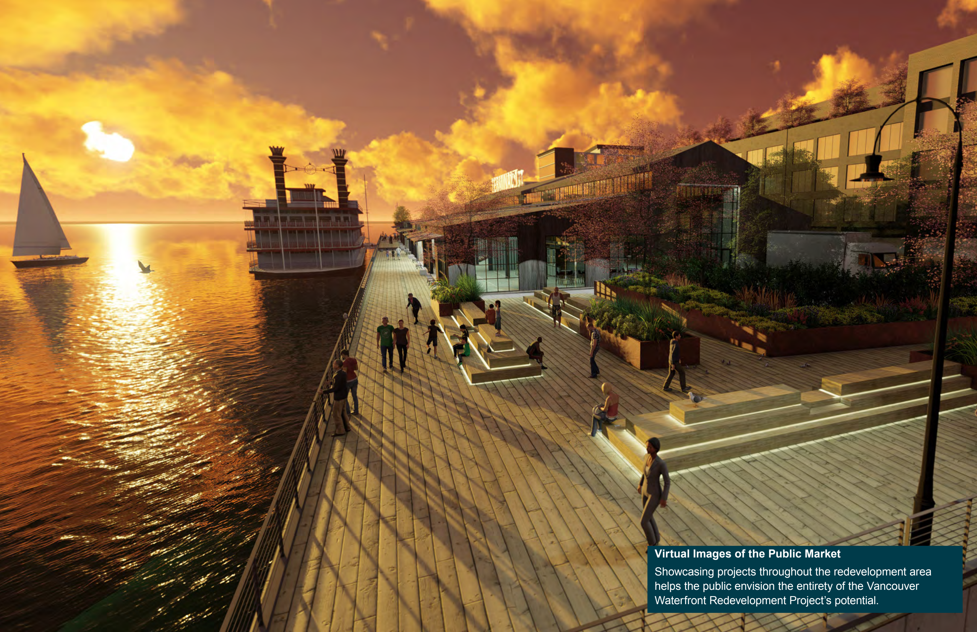
Virtual Images of the Public Market Showcasing projects throughout the redevelopment area helps the public envision the entirety of the Vancouver Waterfront Redevelopment Project's potential.