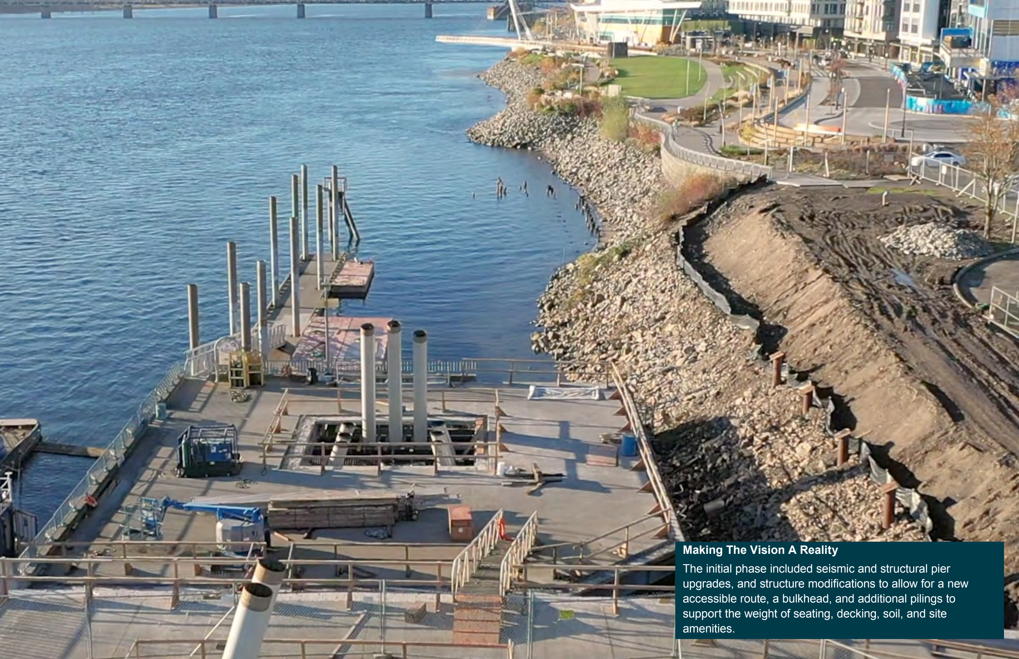
Making The Vision A Reality The initial phase included seismic and structural pier upgrades, and structure modifications to allow for a new accessible route, a bulkhead, and additional pilings to support the weight of seating, decking, soil, and site amenities.