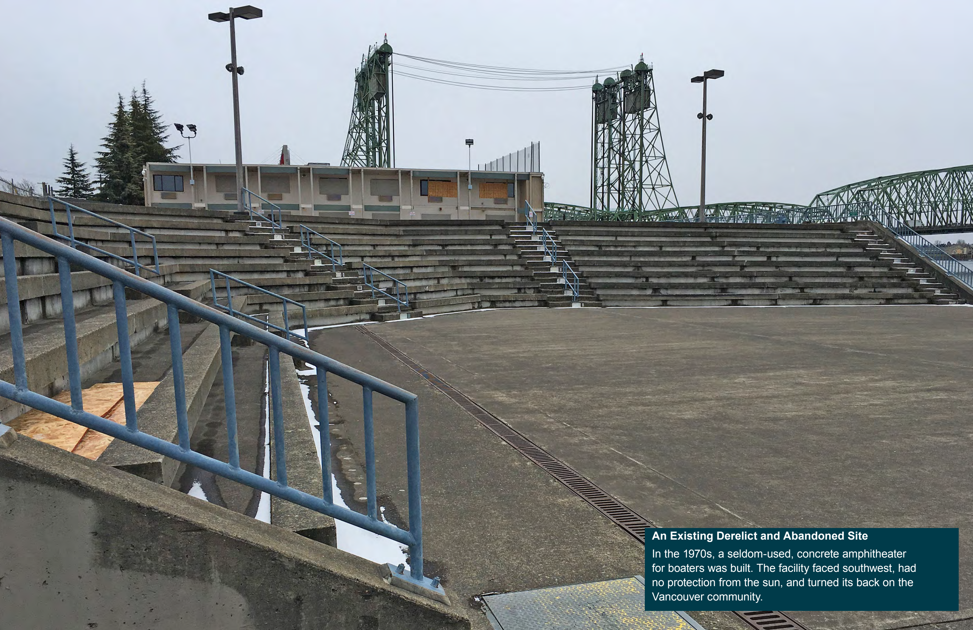
An Existing Derelict and Abandoned Site In the 1970s, a seldom-used, concrete amphitheater for boaters was built. The facility faced southwest, had no protection from the sun, and turned its back on the Vancouver community.