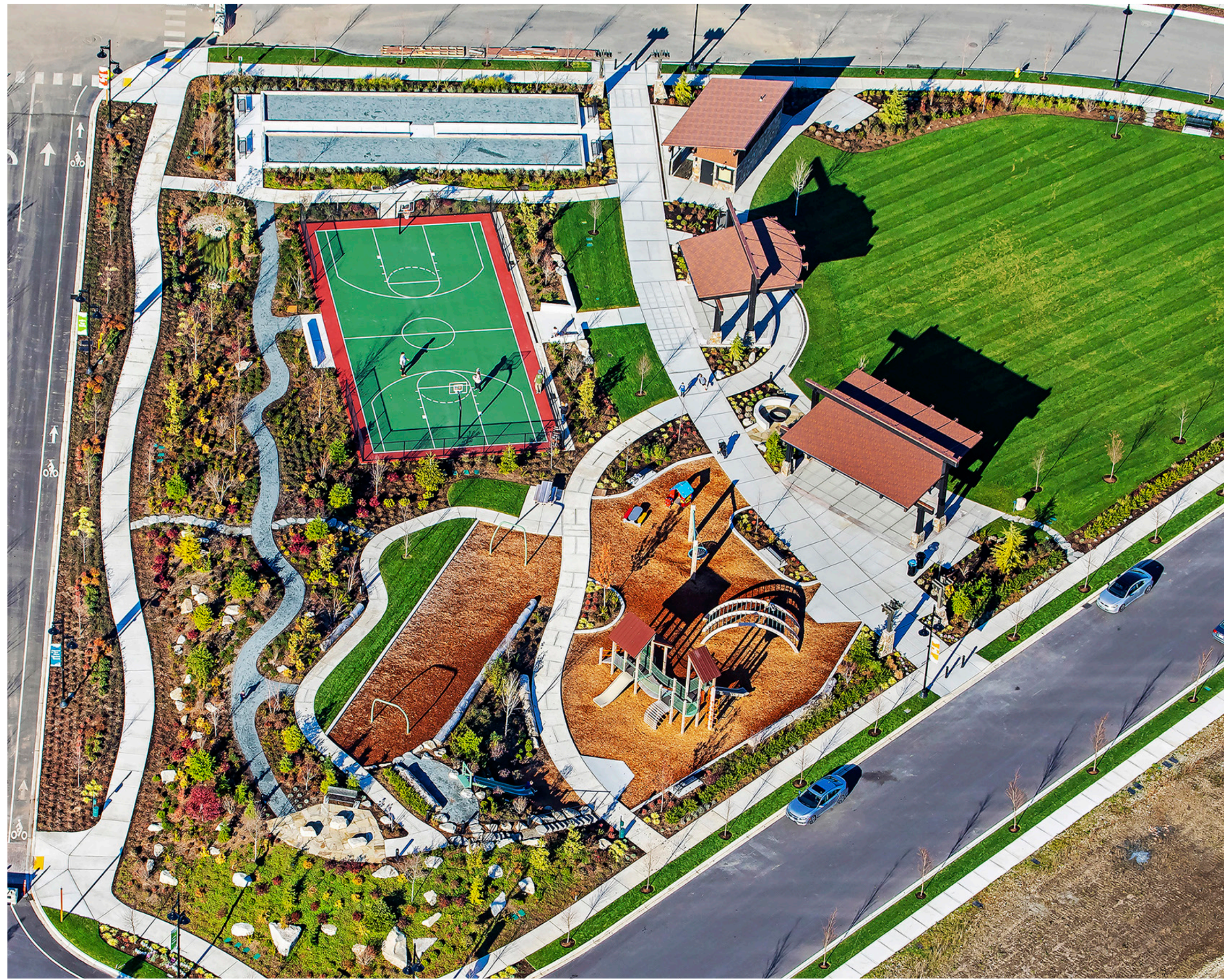
The structures and play areas are aligned along the Arc; a wide central walkway designed to encourage interaction. The permeable park edges and expansive open spaces incites participation and a feeling of inclusion.