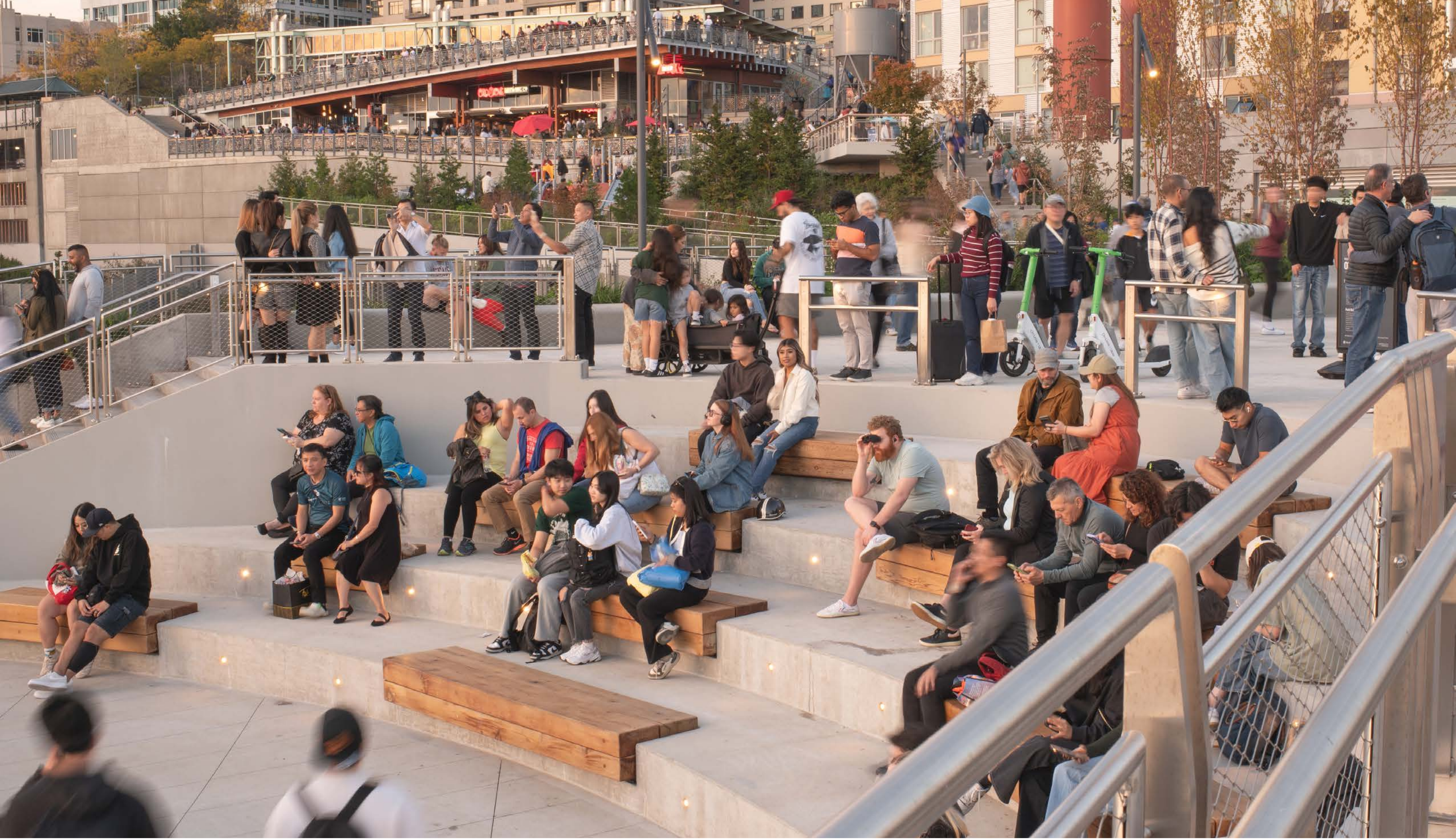
Western Overlook: Oriented towards the bay and mountains, the Western Overlook provides seating with opportunities to enjoy breathtaking sunsets and respite from the city's bustle. Reclaimed Western Red Cedar was used to create comfortable seating of the concrete steps.