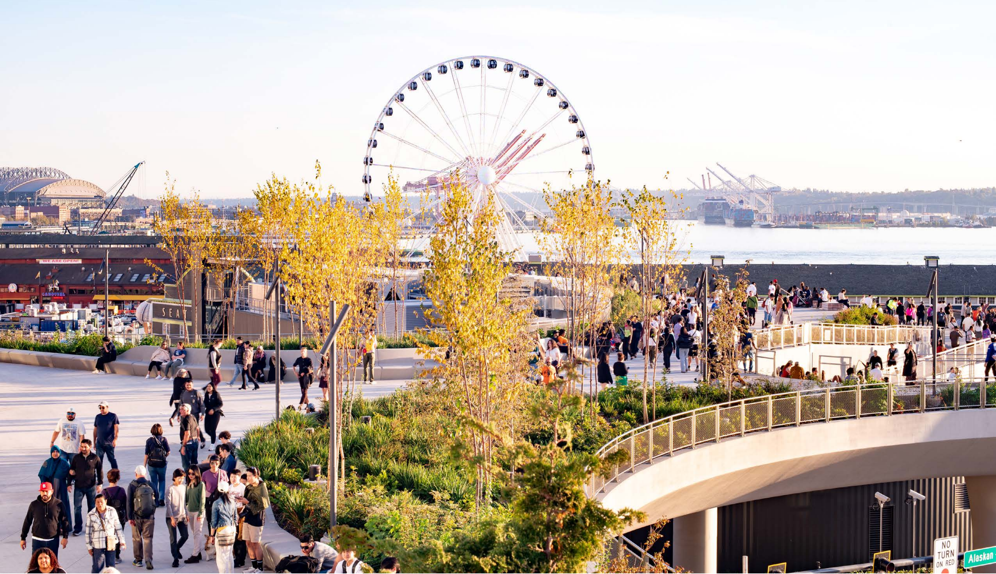
Planting: Planting on the Overlook Walk reflects the native ecology of the Puget Sound bluffs while creating a buffer between pedestrians on the Overlook Walk and vehicular traffic below.