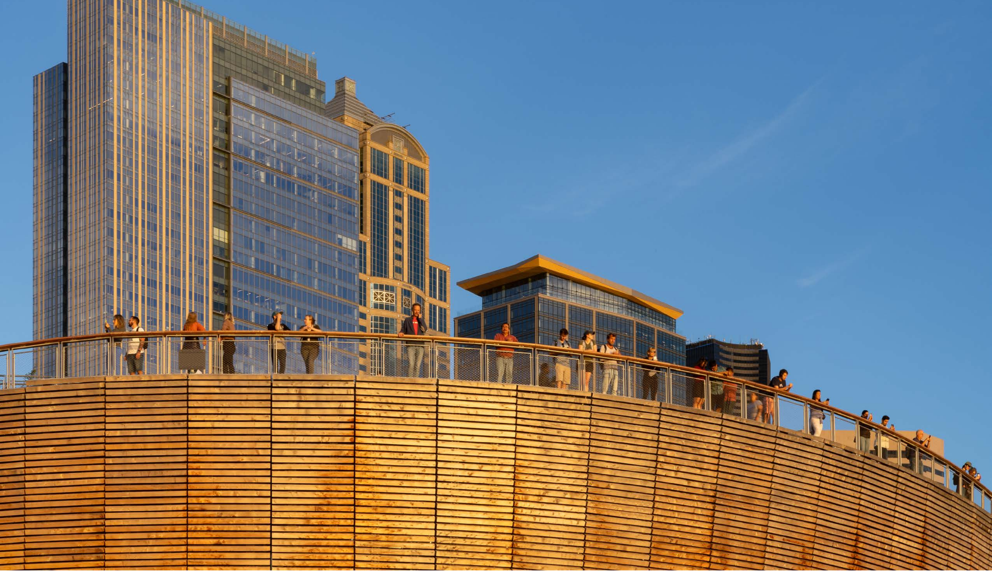
Sustainability: Timber cladding covers the Ocean Pavilion and stair walls in a characteristic Pacific Northwest materiality. The timber used on the project is sourced from tribally owned forests and from reclaimed forests and lake beds in the nearby area.