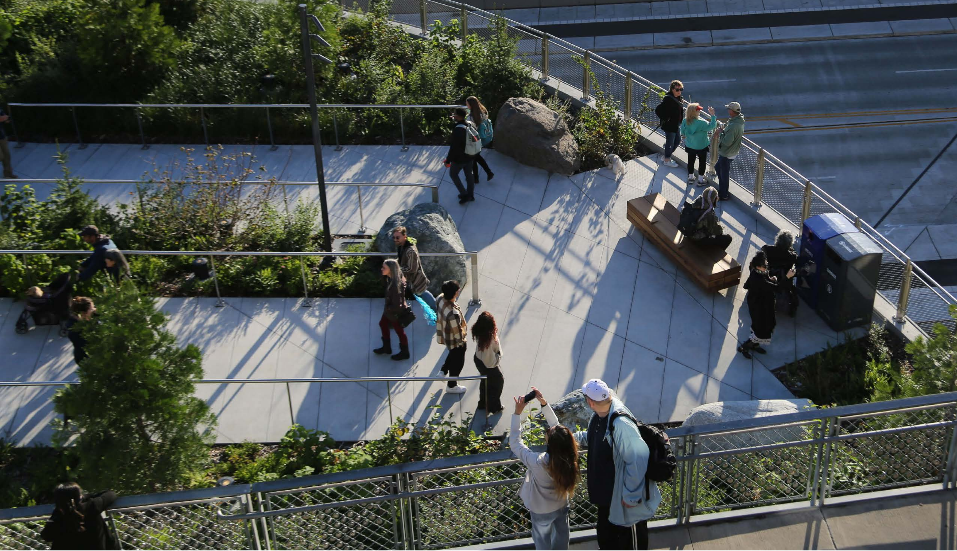
Bluff Walk: Leading pedestrians down a 100-foot vertical grade change through a series of gentle ramps stairs and elevators, the Bluff Walk is flanked with lush native plantings reminiscent of the natural bluff that once existed.