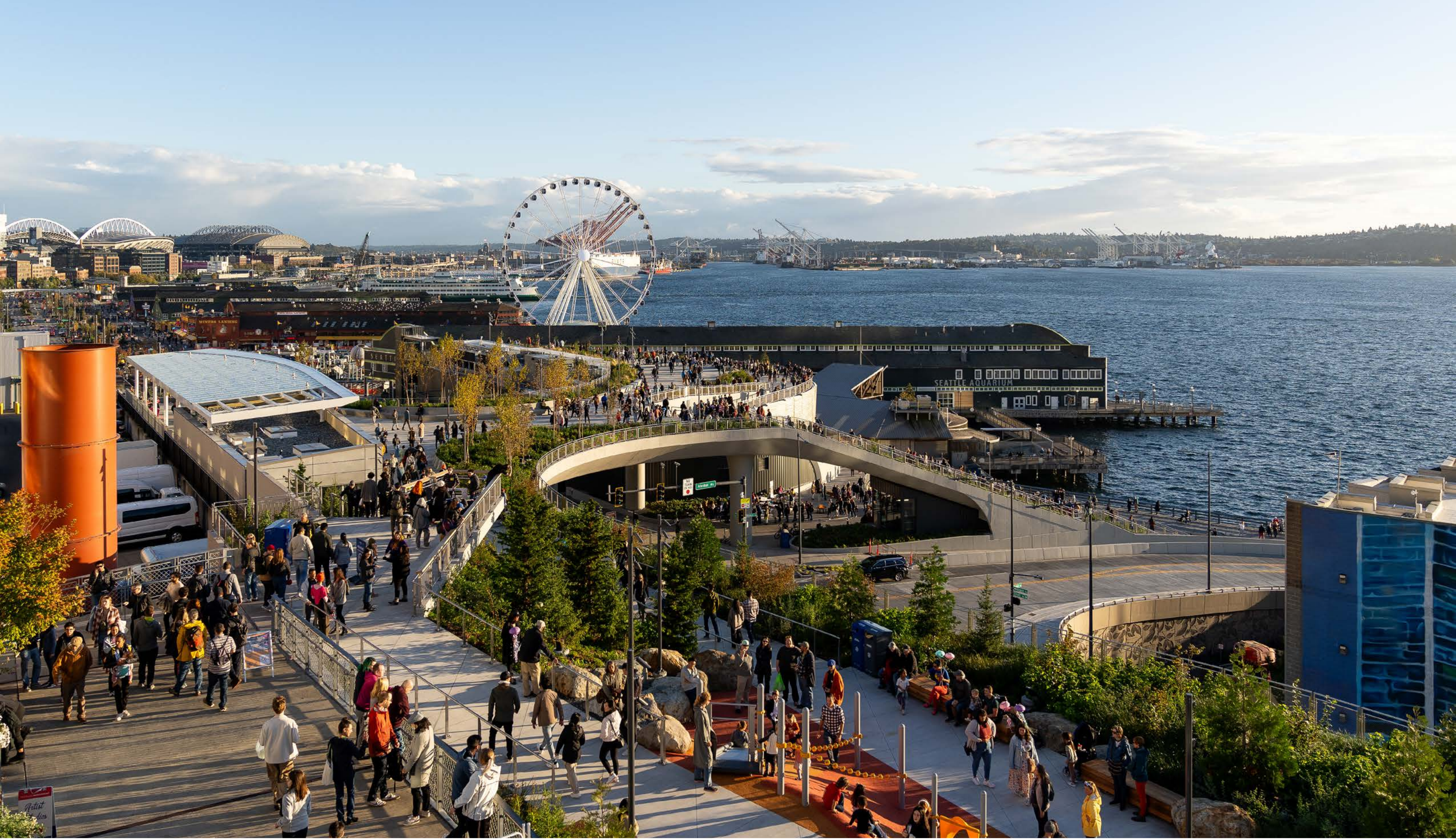
Overlook Walk: Restoring the historic connection between Seattle’s Pike Place Market and the waterfront, Overlook Walk provides a public open space that integrates the sites cultural history as part of the transformative Central Waterfront project.