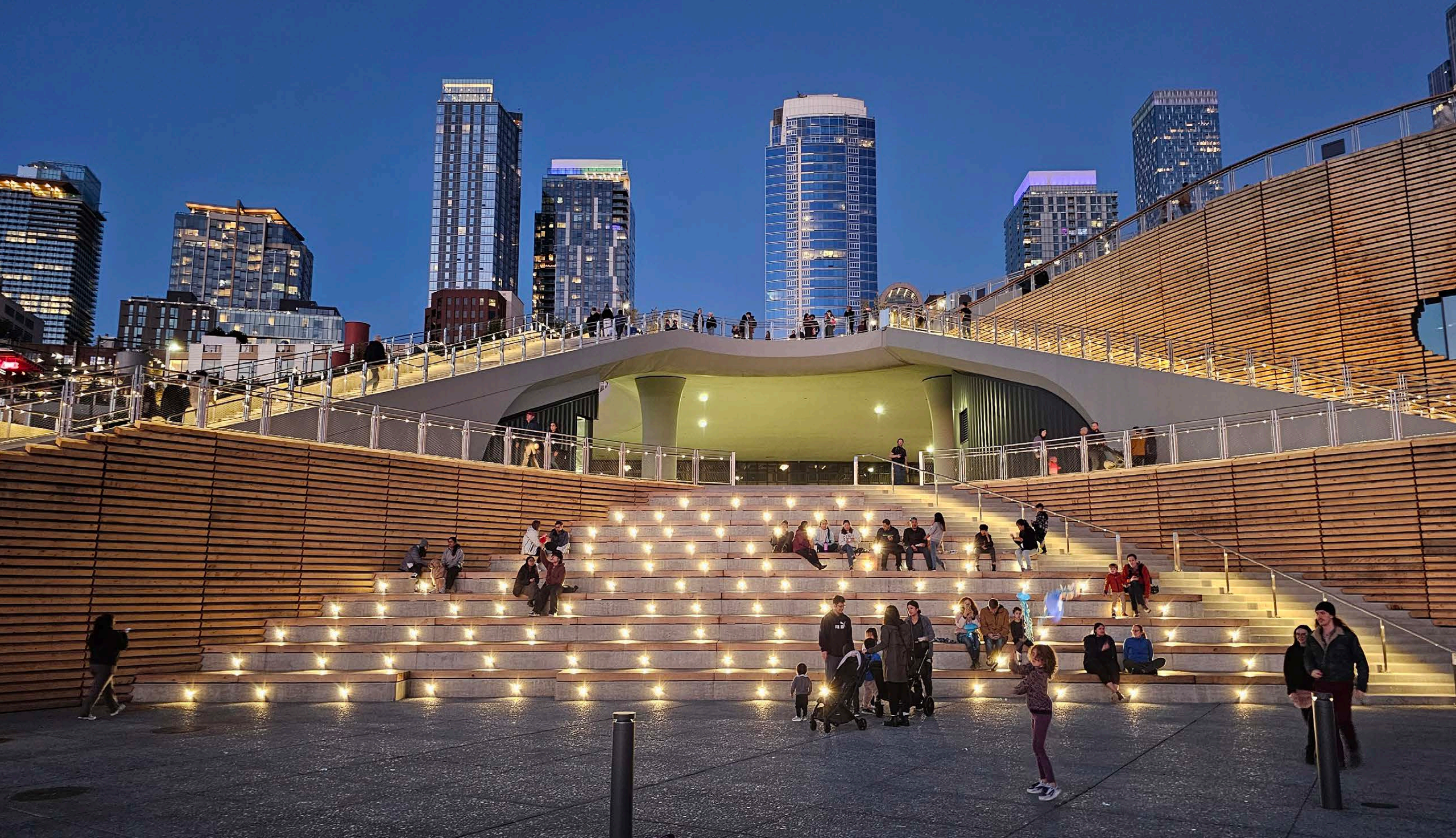
Salish Steps: Nestled between two reclaimed Western Red Cedar clad walls, the Salish Steps create an amphitheater on the waterfront promenade for events, performances, and casual seating.