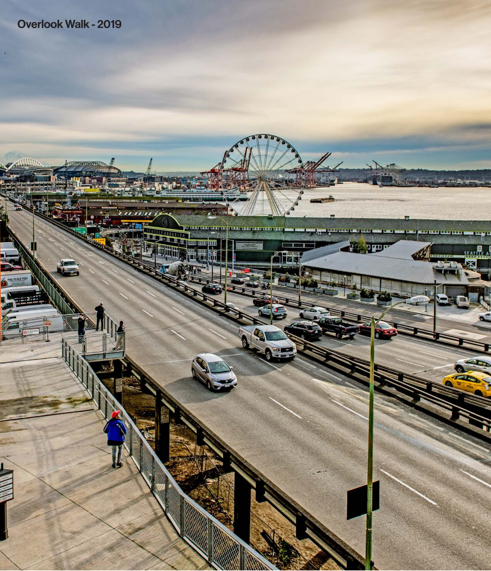
Overlook Walk - 2019