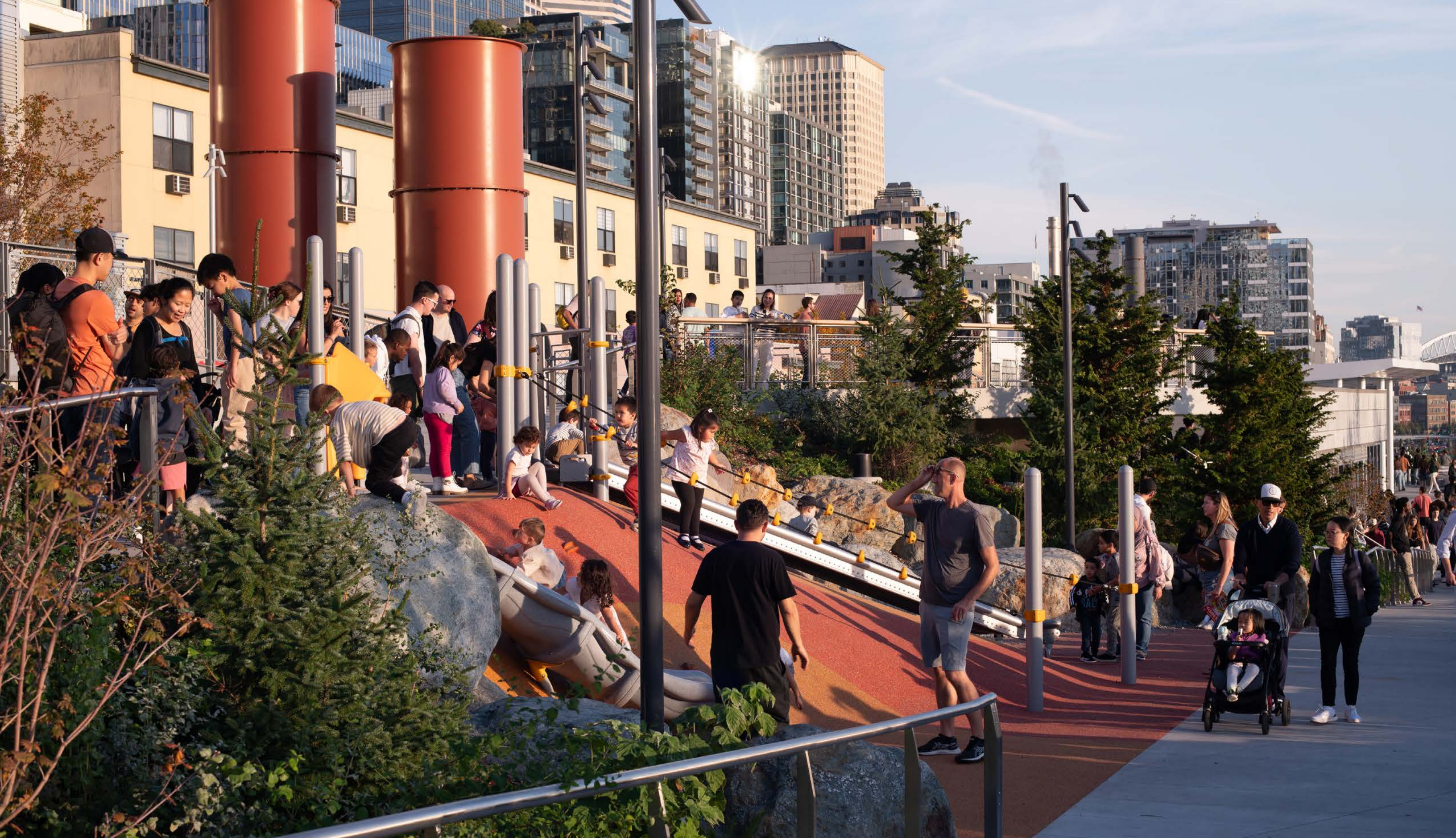
Bluff Play Slopes: Slopes along the Bluff Walk offer opportunity for much-needed children's play in this neighborhood. Slides, climbing slopes, and glacial erratics are very popular among children and parents, who can sit on nearby benches surrounded by high-mountain planting.