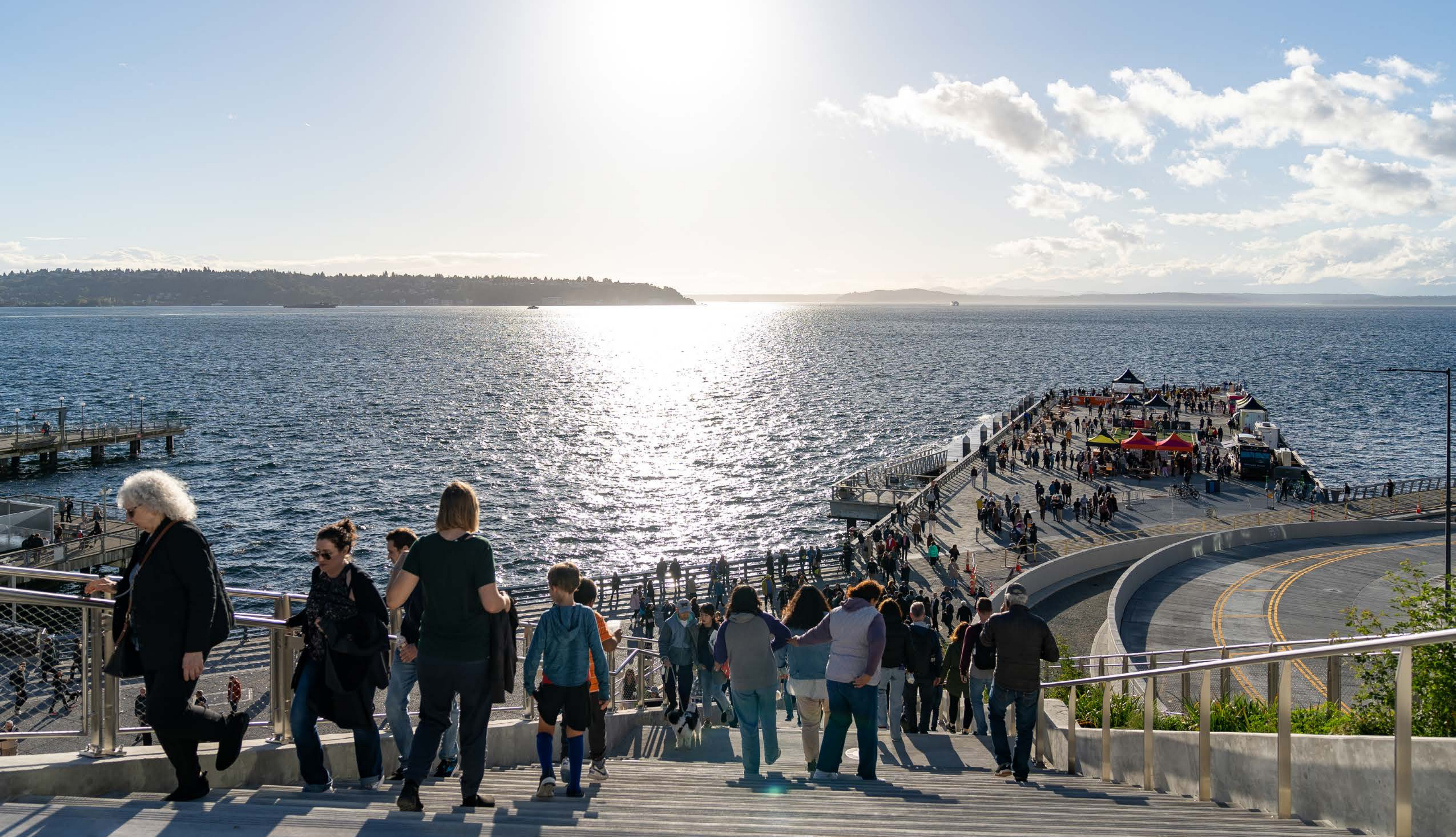
Views and Vistas: The Overlook Walk provides expansive views of Elliott Bay, the Olympic Mountains, the harbor and the city—highlighting the unique position the city of Seattle holds on the waterfront.