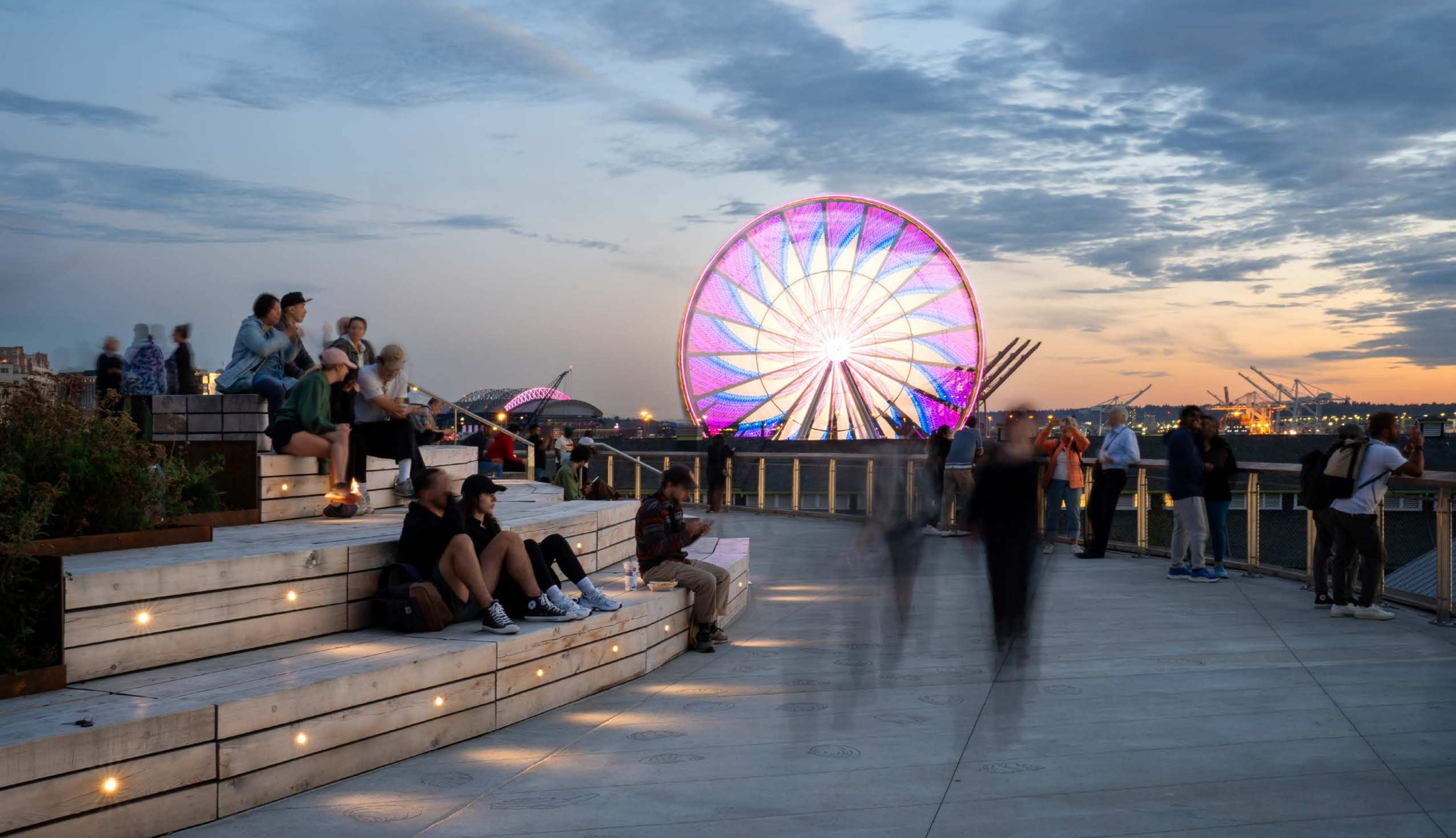
Programming and Activation: The Overlook Walk, Ocean Pavillion Roof, and amphitheaters overlooking Pier 62 all provide ample space for both planned and impromptu programming and performances with the backdrop of the city, sky, and bay.