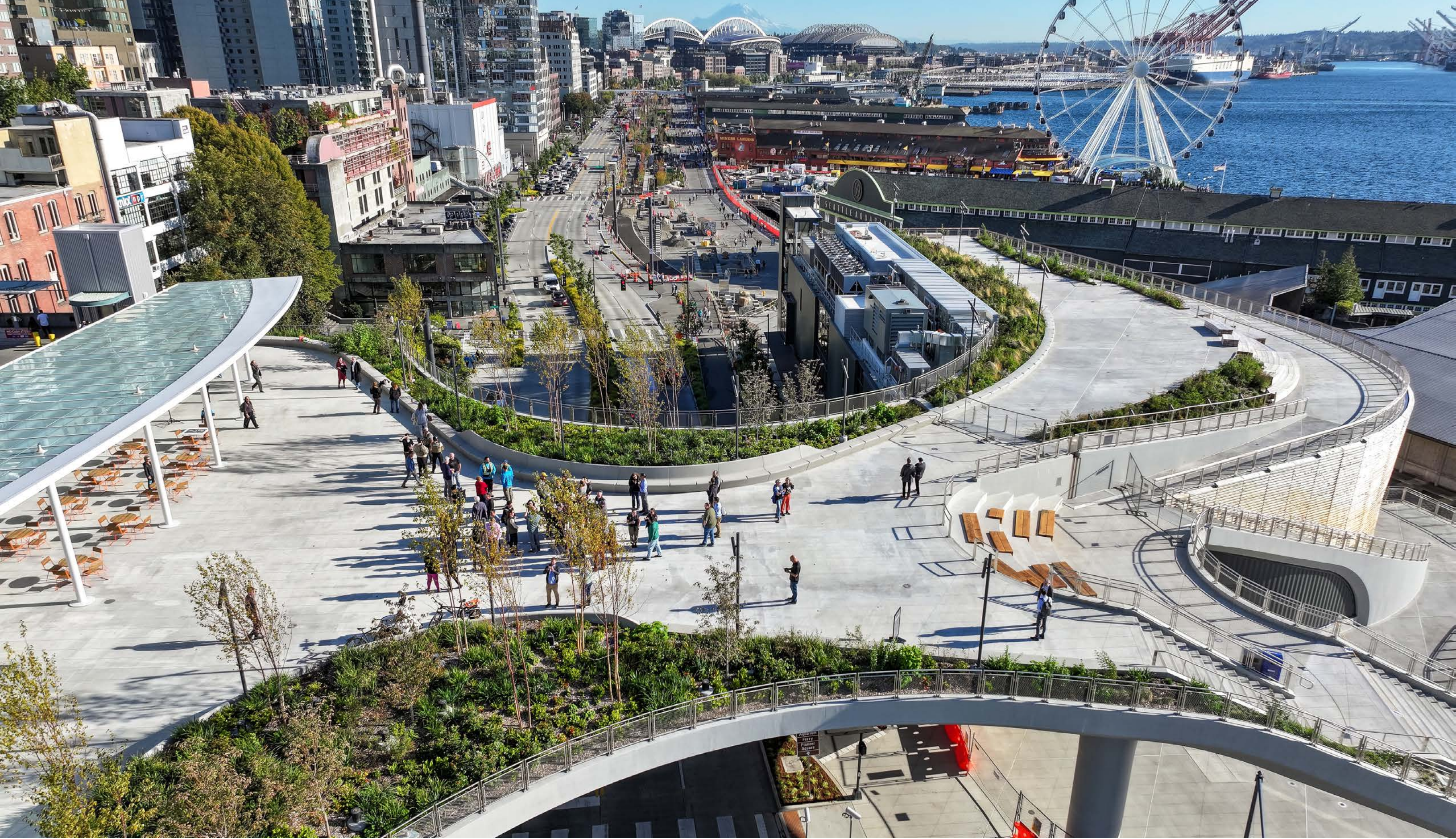
The Bridge: Bridging over Elliott Way, the Overlook Walk is a heroic example of engineering that is aesthetically pleasing and structurally essential. It links the historic Pike Place Market to the Seattle Aquarium Pavilion, the waterfront promenade, and Pier 62.