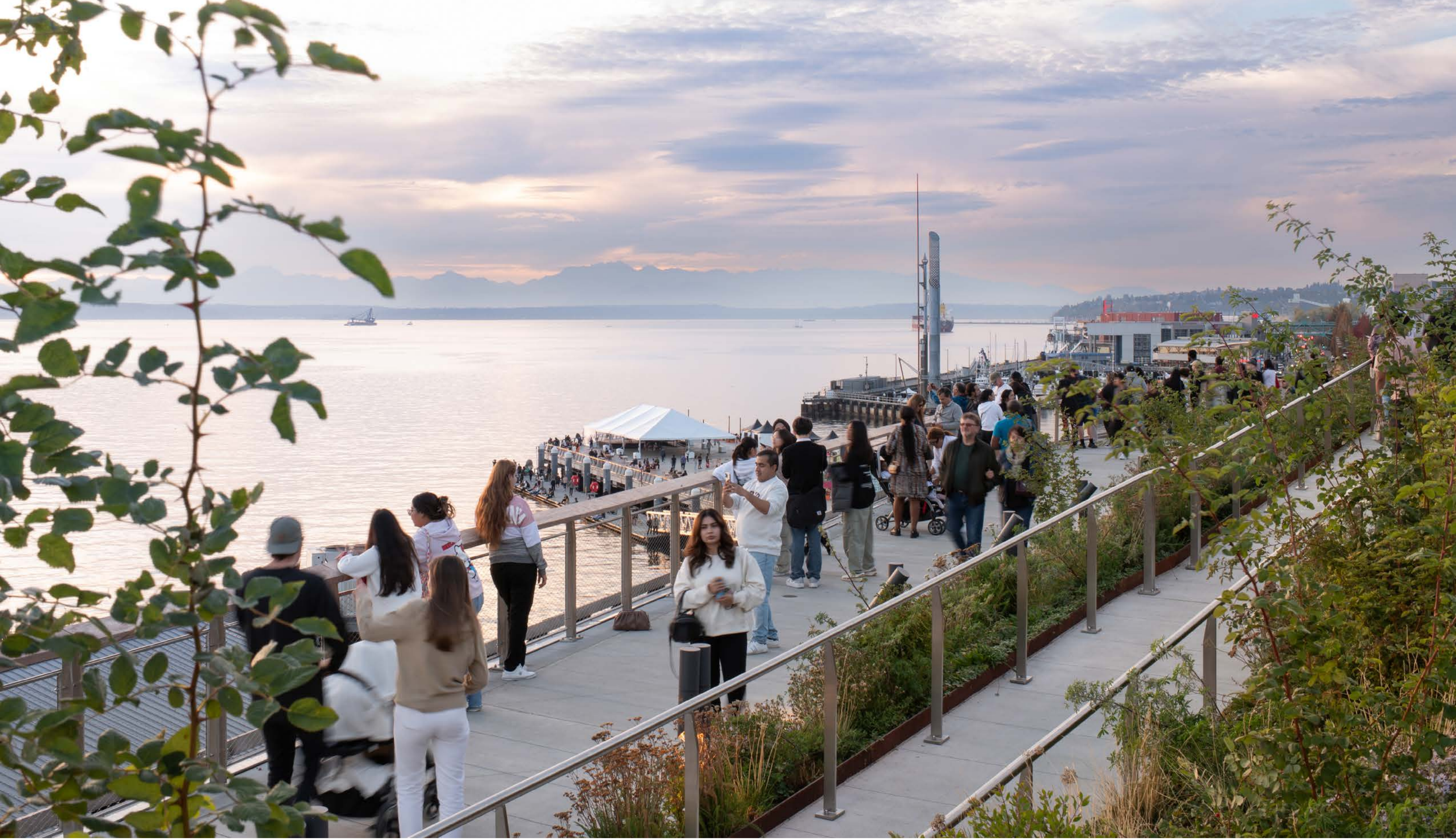
Ocean Pavilion Roof: The Overlook Walk seamlessly connects into the new Seattle Aquarium Ocean Pavilion roof to create nearly 1.5 acres of rooftop gardens with elevated 360-degree views.