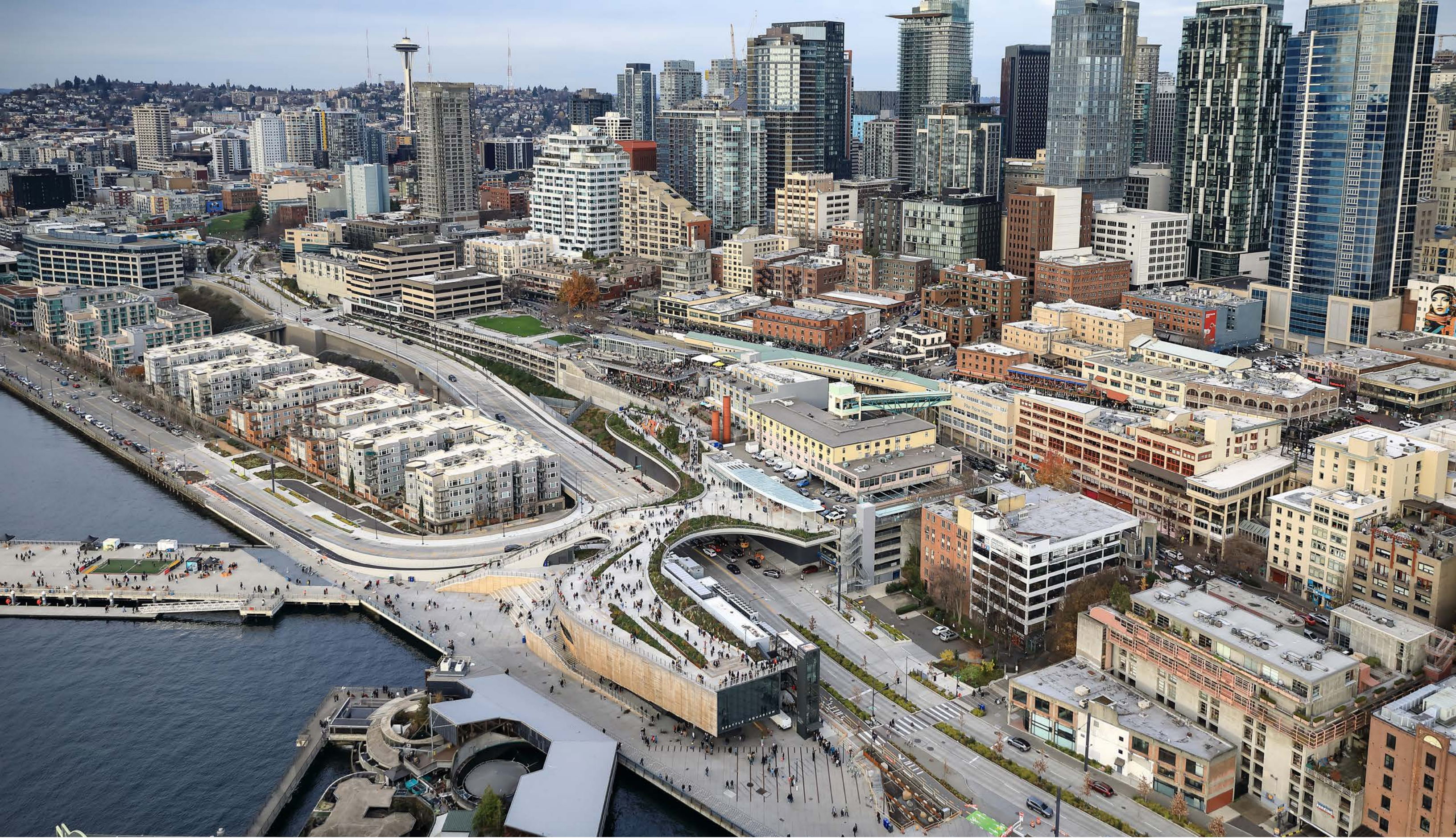
New Infrastructure: Aerial view of Overlook Walk, the Ocean Pavilion, Pier 62, and Pike Place Market, while the promenade remains under construction. This impressive pedestrian infrastructure solidifies Seattle's success in rebuilding, restoring, and reconnecting its historic waterfront to the city.